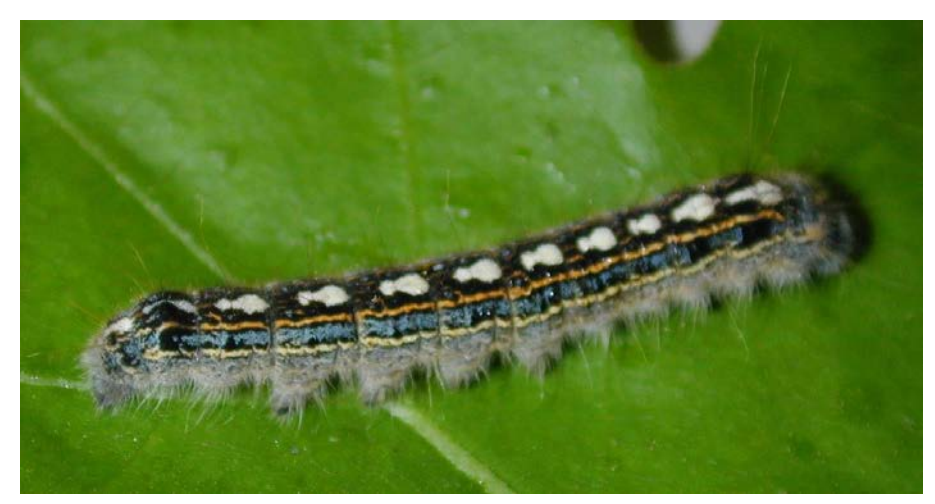
Fig 2. Forest tent caterpillar.