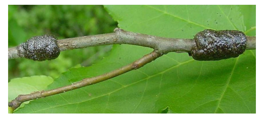
Fig 4 . Forest tent caterpillar egg masses.