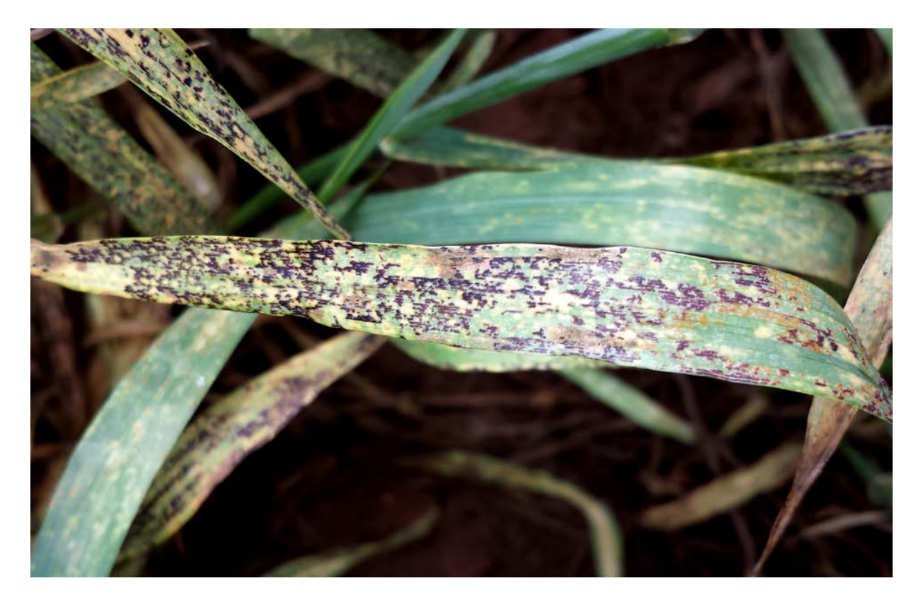
Fig 2. Telial stage of stripe rust (note some pustules are still actively sporulating as indicated by orangish-yellow color.

I get the impression from talking to Aaron Henson (County Educator; Tillman County) as well as other growers and consultants around the state that this is similar to what they are seeing. Wheat seems to range from boot to heads emerging, so if you are contemplating applying a fungicide to protect a promising wheat yield, I suggest it be done soon. Remember, GS 10.5 (heads fully emerged but not yet flowering) is the cut-off for applying fungicides for wheat foliar diseases. That point likely is not far away for much of southern and central Oklahoma. It likely is a bit farther away for northern and northwestern Oklahoma, but it is much better to apply a fungicide a little early rather than after the flag leaf is infected.