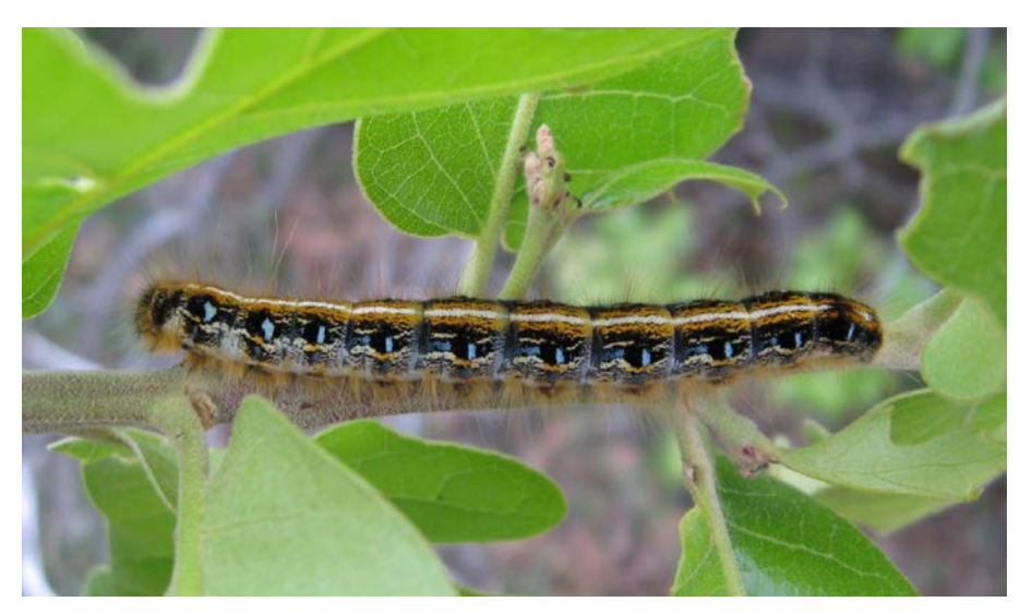
Fig 1. Eastern tent caterpillar.