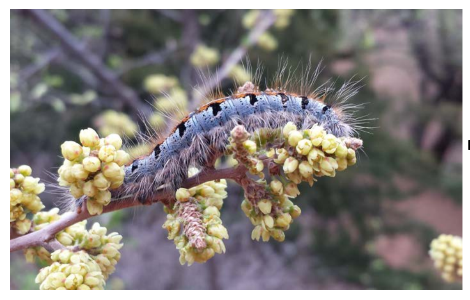
Fig 3. Western tent caterpillar.