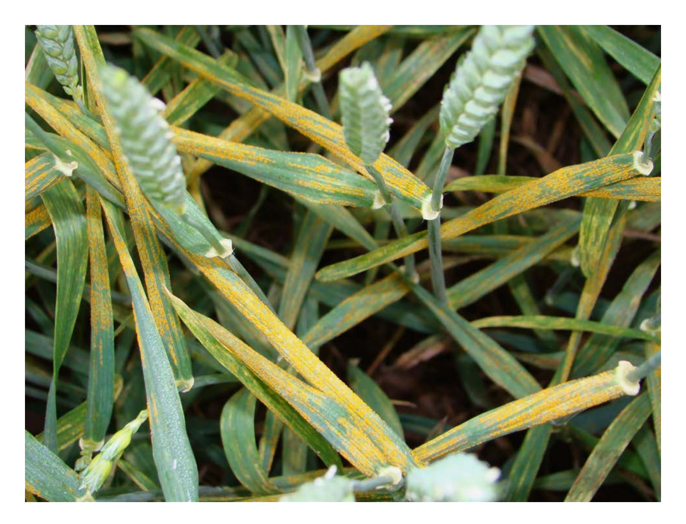
Fig 1. Stripe rust with active, sporulating pustules

indicates the disease is "shutting down," which it was prior to this week. However, with the cool and wet weather since Monday, there likely will be a "reactivation" of stripe rust – especially given that cool and wet weather is forecast for the next 5-10 days as well!