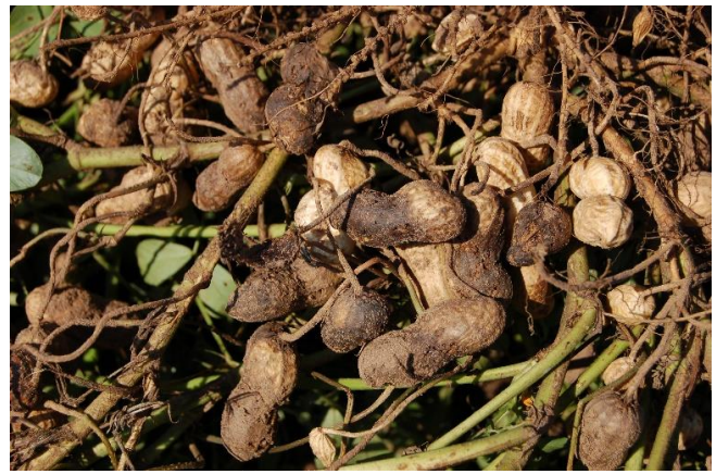
Figure 4: Pythium pod rot on virginia-type peanuts.