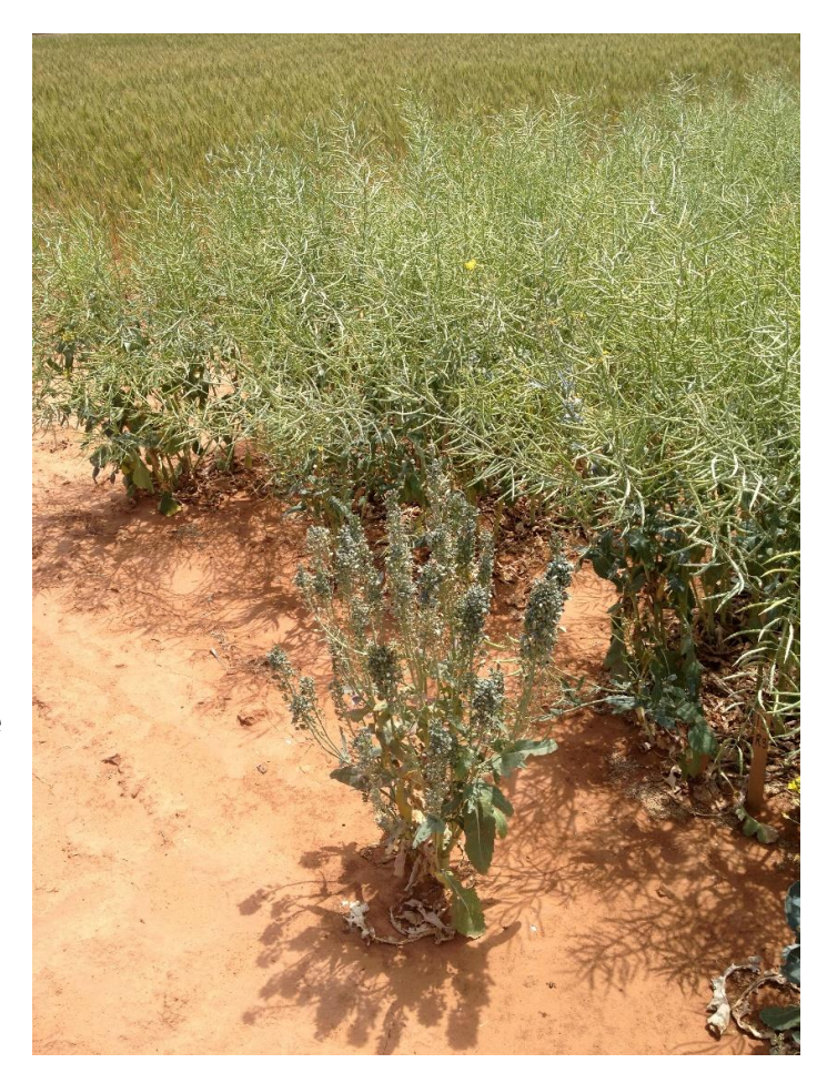
Figure 9: Aster yellows of canola.

Aster yellows - Aster yellows is caused by a phytoplasma, a wall-less, bacterialike pathogen spread by a leafhopper. Because phytoplasma diseases are systemic and insect transmitted, they behave very much like a virus disease. Affected plants do not flower properly and produce sterile green rather that fertile yellow flowers. Severely affected plants appear stunted, have a purple color to leaves and do not produce grain (Fig. 9). We normally see a low level of this disease, particularly in research trials that have tilled alleys, and in fields with poor plant stands. Both of these predisposing factors occurred in research trials at Perkins this year where some plots had over 30% of plants affected. There has been little research done on aster yellows disease of canola except that we know that the aster leafhopper is active in the fall and we suspect that fall infections produce the most severe symptoms.