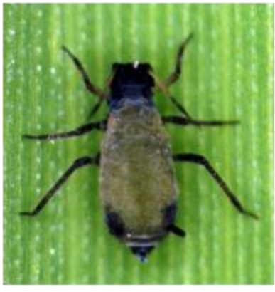
Corn leaf aphid