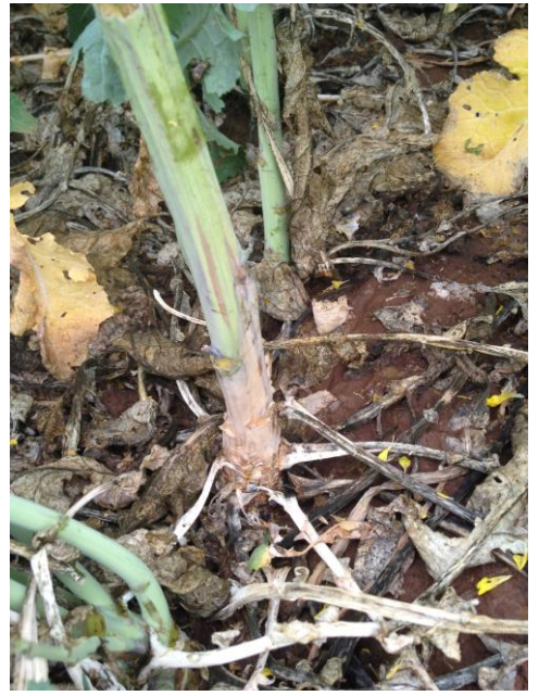
Figure 6: Sclerotinia stem rot on canola.

Sclerotinia stem rot - Sclerotinia stem rot in Oklahoma is caused by two different species of the fungus Sclerotinia . The disease causes a white colored stem rot after flowering in the spring (Fig. 6) that kills plants prior to grain fill. Plants killed by S. sclerotiorum have large black sclerotia (fungus seeds) in the stem cavity up to <sup>1</sup>/<sub>2</sub> inch in size (Fig. 7) while plants killed by S. minor have more numerous, smaller black sclerotia imbedded in the stem about 1/8 inch in size (Fig. 8). The sclerotia serve as seeds of the fungus that can germinate to infect plants directly, or indirectly via a tiny cup mushroom that releases airborne spores which colonize flower petals before invading stems. S. sclerotiorum was observed in the demo plots at Kingfisher Co. while S. minor was observed at the demo plots at the Caddo Research Station. It is currently occurring at low levels but its presence is worth monitoring. As peanut growers can attest, Sclerotinia disease can become a persistent problem when sclerotia build up to high levels in fields because they can survive in soil for up to 10 years. Crop rotation with non-hosts such as wheat is effective to prevent the buildup of sclerotia, but is of little value where levels of the fungus are high. Canola growers should avoid short crop rotations where this disease has been identified. We expect to publish a fact sheet shortly with more information on the biology and management of Sclerotinia stem rot.