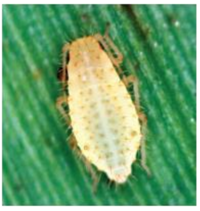
Yellow sugarcane aphid