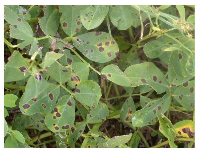
Figure 5: Early leaf spot on peanuts.

Propiconazole is one of the oldest triazole or Group 3 fungicides registered on peanuts and other numerous other crops. It is marketed alone as Tilt, PropiMax, or Bumper. It is also sold in combo products such as Stratego (+ trifloxystrobin) and Tilt/Bravo (+ chlorothalonil), which are commonly used on peanuts for control of leaf spot (Fig. 5). Apparently the EU no longer accepts the current method for measuring propiconazole residue as valid and expects that the fungicide will no longer be used on peanuts exported into the EU until the issue is resolved. The tolerance (maximum allowable residue level or 'MRL') will have to be reset based on methods accepted by the EU, which