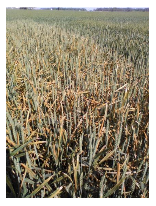
Figure 1: Severe stripe rust in Ohio – Dr. Pierce Paul

have seen this disease in the state in 13 years. Several varieties in fields south of interstate 70 and west of interstate 71 are severely affected, with substantial damage to the flag leaf well before flowering in multiple hot spots in some field. As we approach flowering in more northern counties, the reports continue to come in. Several fields have already been sprayed for stripe rust, but the dilemma facing most growers is whether to spray for stripe rust or wait to spray for scab in fields not yet at anthesis."