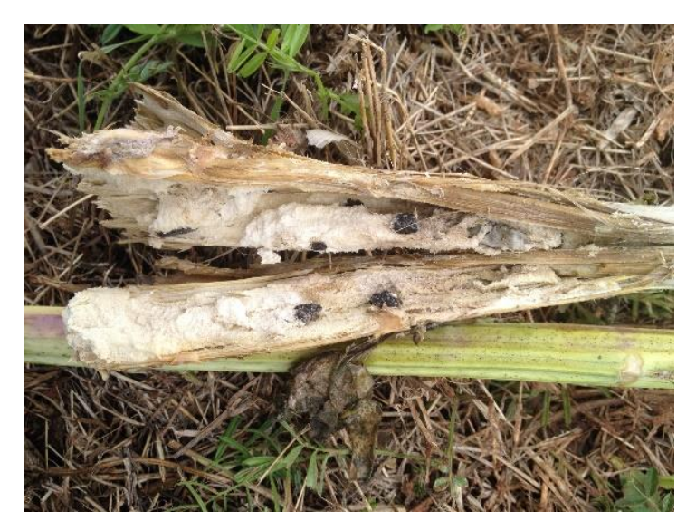
Figure 7: Large sclerotia of Sclerotinia sclerotiorum.