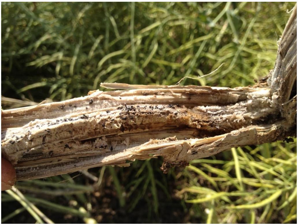
Figure 8: Small sclerotia of Sclerotinia minor.

Aster yellows - Aster yellows is caused by a phytoplasma, a wall-less, bacterialike pathogen spread by a leafhopper. Because phytoplasma diseases are systemic and insect transmitted, they behave very much like a virus disease. Affected plants do not flower properly and produce sterile green rather that fertile yellow flowers. Severely affected plants appear stunted, have a purple color to leaves and do not produce grain (Fig. 9). We normally see a low level of this disease, particularly in research trials that have tilled alleys, and in fields with poor plant stands. Both of these predisposing factors occurred in research trials at Perkins this year where some plots had over 30% of plants affected. There has been little research done on aster yellows disease of canola except that we know that the aster leafhopper is active in the fall and we suspect that fall infections produce the most severe symptoms.