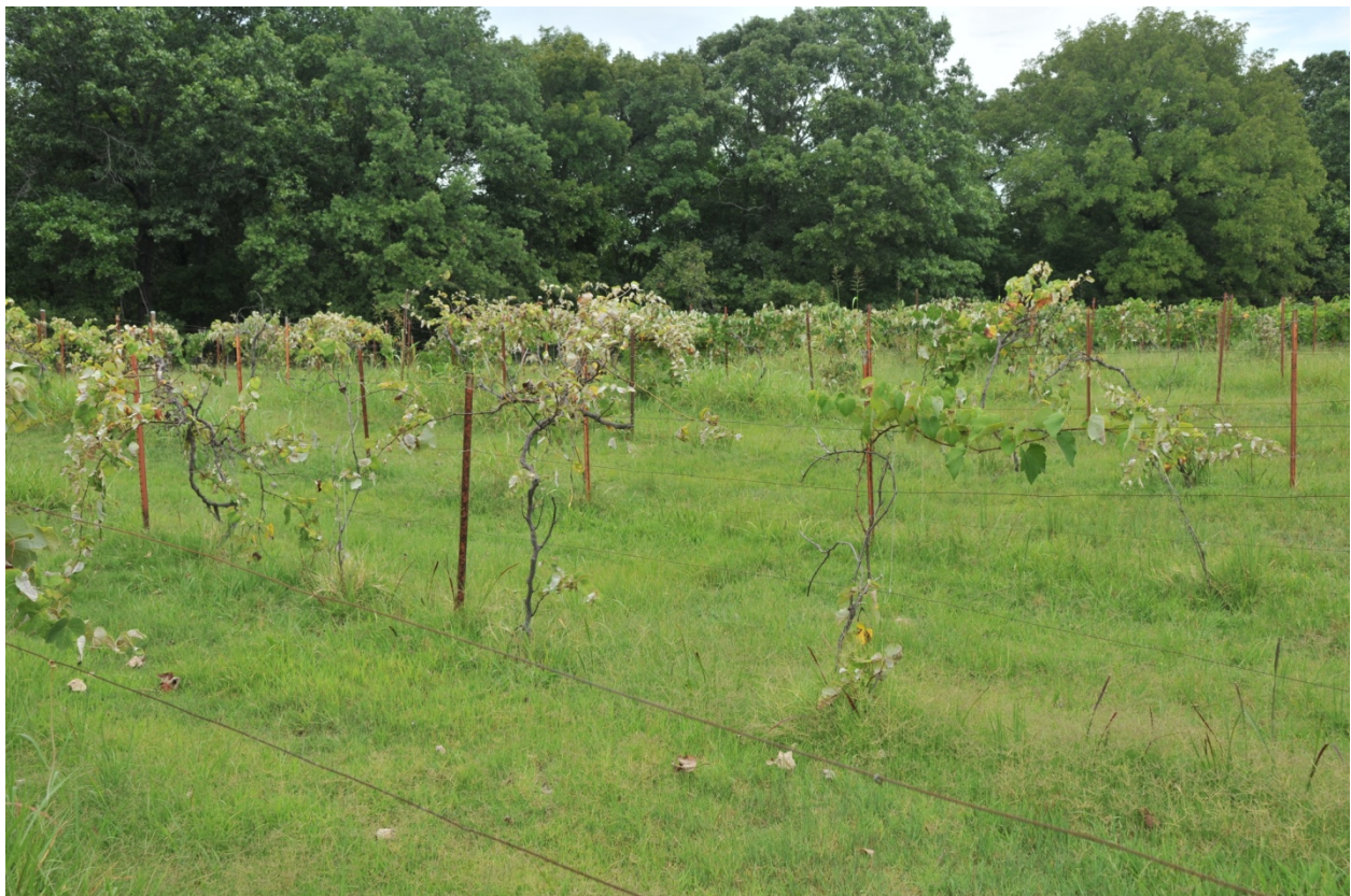
Figure 2. Wilting and premature defoliation symptoms of grapevines, indicative of Pierce's disease.

Pierce's disease is spreading in the State and it appears that the bacterium can over-winter. Growers throughout the vineyard production regions of Oklahoma should be on the lookout for symptoms of Pierce's disease. The symptoms are perennial and will appear late in the summer when weather conditions are predominately hot and dry, or when plants are under drought stress. Plants will exhibit stress, with wilting of shoots, and premature defoliation typically occurring (Fig 2). Plants will also yield no fruit or have limited fruit production with poor quality. Chlorosis and green fading colors will develop at the edges of leaves, which dry and turn brown (Fig 3). Some vines will have a 'matchstick' symptom where the leaves have dropped from the plant, but petioles remain attached (Fig 4). Marginal browning can take on an undulating appearance as it moves toward the veins of the leaf. A yellow to red-brown band may be present between the green and scorched areas of the leaves (Fig 3 and 5). Leaf symptoms of Pierce's disease can look very similar to drought stress symptoms, however, the yellow or red-brown band between green and scorched areas will be absent in vines suffering from drought stress.