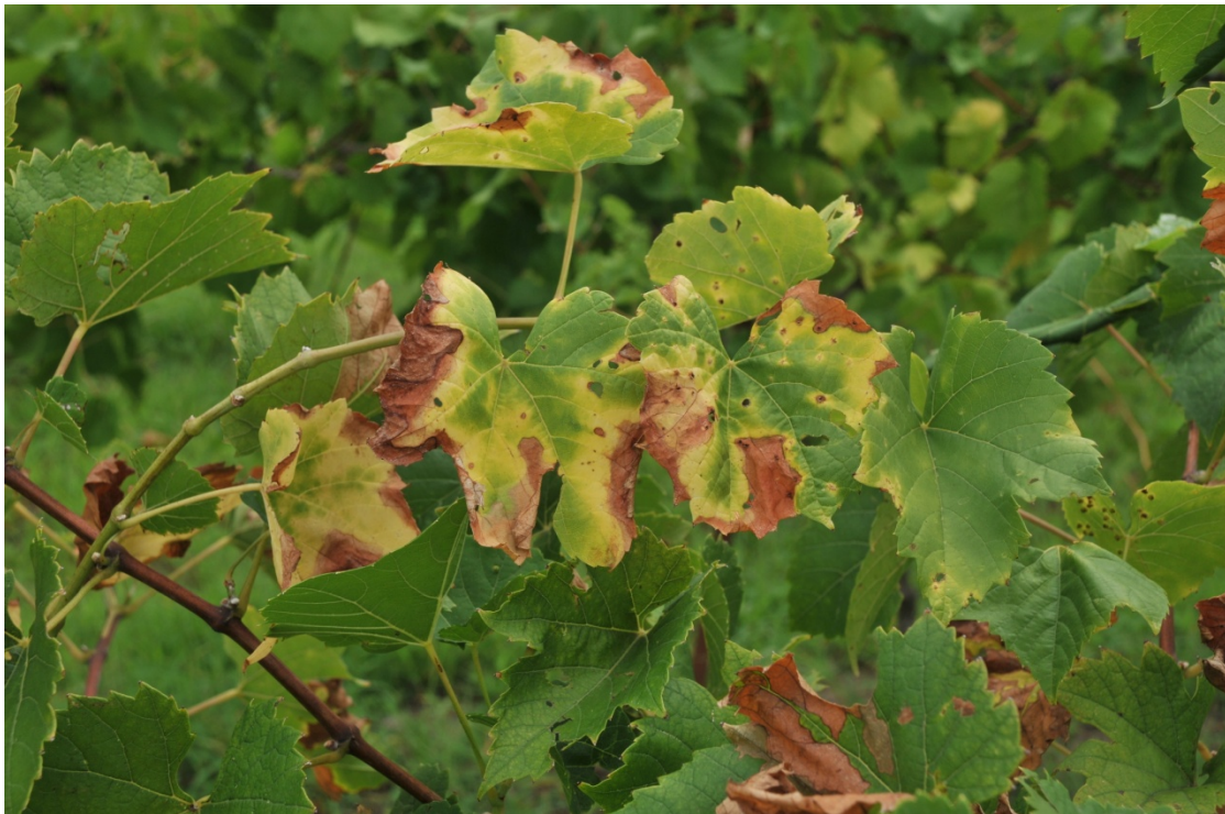
Figure 3. Dry, brown scorch symptoms of grape leaves infected with Xylella fastidiosa . Note the presence of the yellow border between green and brown tissue.