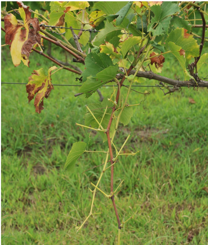
Figure 4. 'Matchstick' symptom of Pierce's disease, where the leaves have dropped from the plant and petioles remain attached.