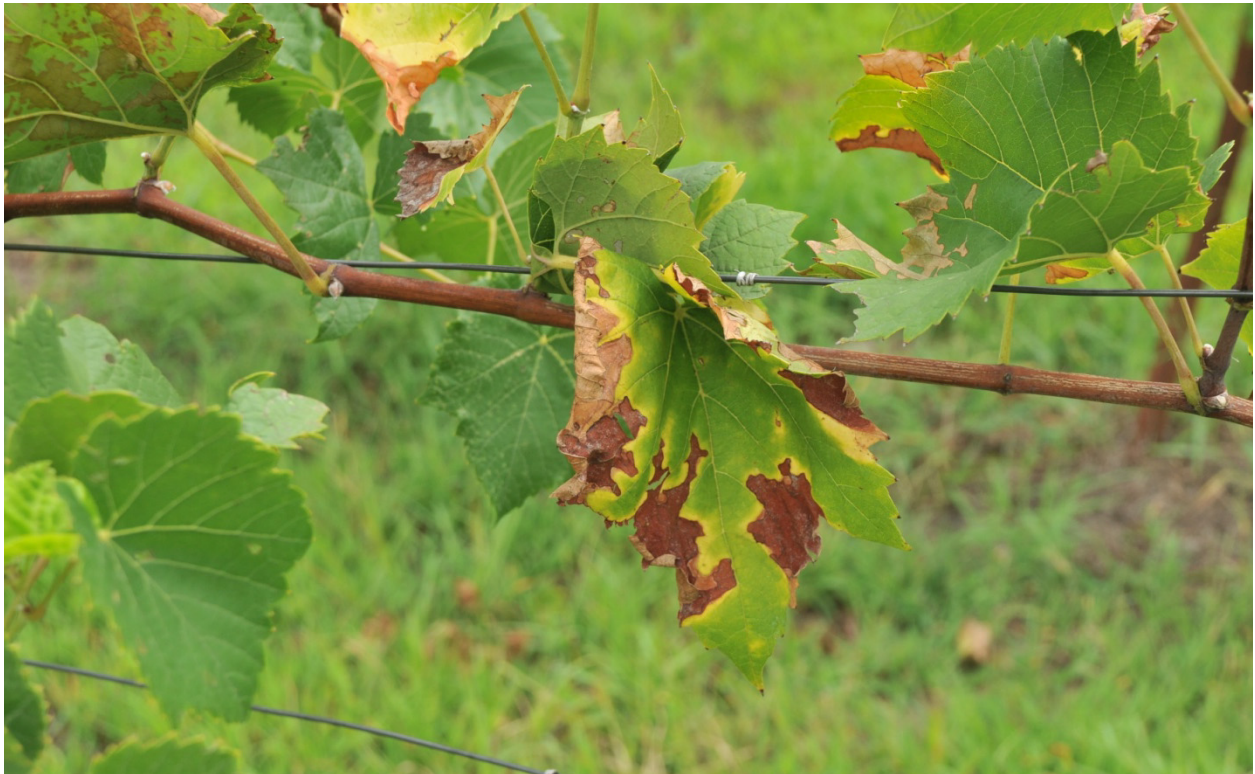
Figure 5. Symptoms of grape leaves with Pierce's disease, photographed in late August. Note green tissue separated from brown tissue by yellow borders.