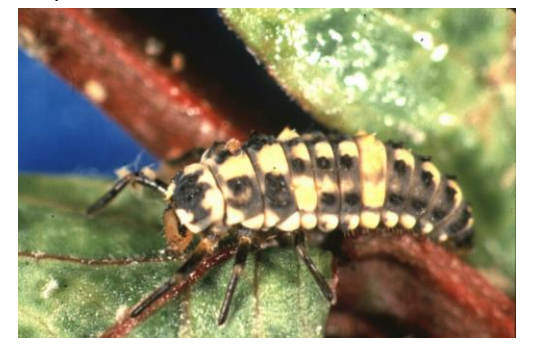
Lady beetle larva