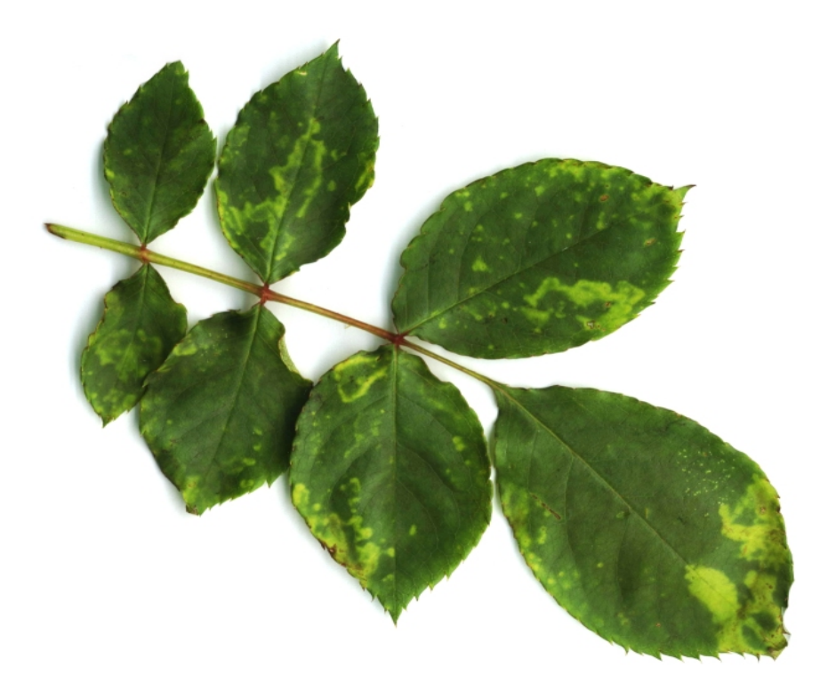
Fig 1. Chlorotic ringspots and line patterns are symptoms of Rose Mosaic Virus Complex.

The moderate temperatures and overcast days are great for the development of virus symptoms. Plant viruses manifest themselves with chlorotic spots, streaks, ringspots, mosaic and mottling. (Fig 1). In some cases, necrotic spots may be observed. We offer many tests for plant viruses, but tests have not been developed for all of them. In the past few weeks, we have received samples with the following plant viruses.