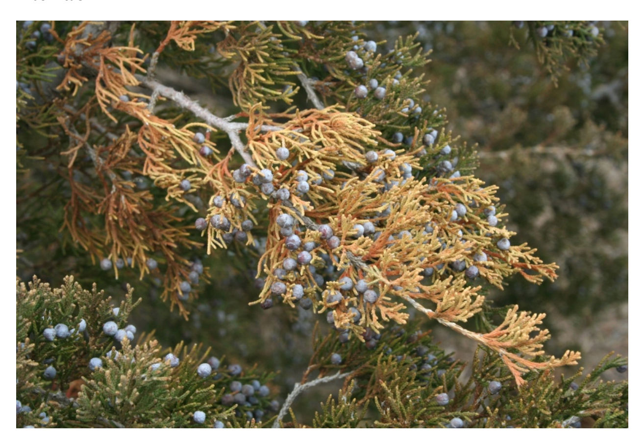
Fig 4 . Discoloration on needles of cedar is due to environmental stresses and possibly a pathogen.

The PDIDL has received many samples of conifers from across Oklahoma with needle discoloration and branch dieback (Fig 4). Many of these are Eastern red cedars which are generally able to withstand Oklahoma's weather extremes. We have also received samples from Blue Atlas cedar, Arizona cypress, Leyland cypress, Alaskan Cypress, Deodora cedar and Arborvitae.