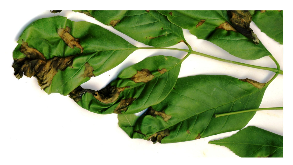
Fig 2. Necrotic spots and leaf tip blight suggest that this ash sample has anthracnose.

We did not receive many foliar fungal samples last year because weather conditions were not favorable for disease development. Most fungi require free water and/or high humidity to cause infections. The moderate temperatures and rainy weather this spring have resulted in many fungal foliar diseases. Symptoms include small spots on the leaves which may expand and coalesce so that the entire leaf is discolored (Fig 2). In severe cases, the twigs may also become infected. Here is a summary of some of the leaf spots, anthracnose and rust problems that we have observed this week. You should expect to see many cases of this type of problem in the next month.