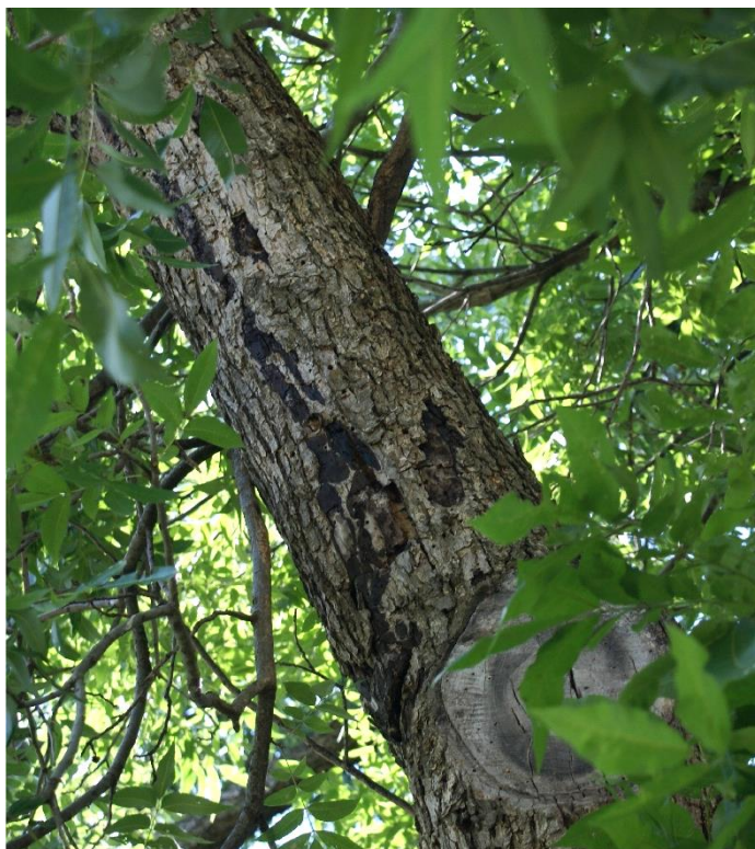
Fig 2. One limb was killed by Hypoxylon canker and subsequently removed. The adjacent limb is in decline and the stroma (fruiting structure) of the fungus is visible.

Management of Hypoxylon canker begins with prevention. Trees should be watered during periods of drought. Avoid injury to the trunk during mowing operations and practice proper pruning techniques. Remove dying and dead branches as they appear. Diseased wood should be disposed of by burning or burial.