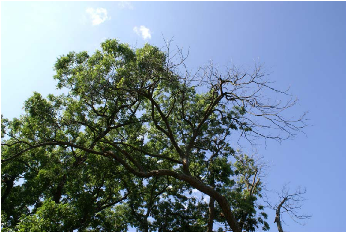
Fig 1. Dieback in a native pecan tree due to Hypoxylon canker.

susceptible trees in the area and new invasions are initiated. Trees under stress are more likely to become diseased than trees that are healthy and well-cared for.