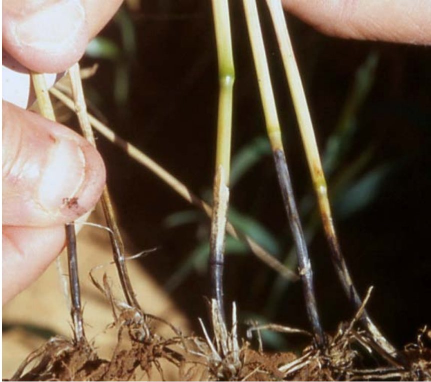
Severe take all on lower stems.