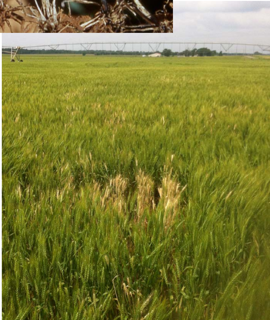
Isolated spots of take all in a wheat field in Kay Co.