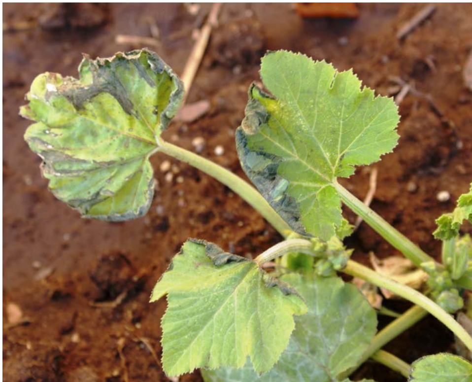
Fig 3. Leaf roll and discoloration on summer squash leaves after 33°F temperatures. The plant was covered with a plastic container during the low temperature event.