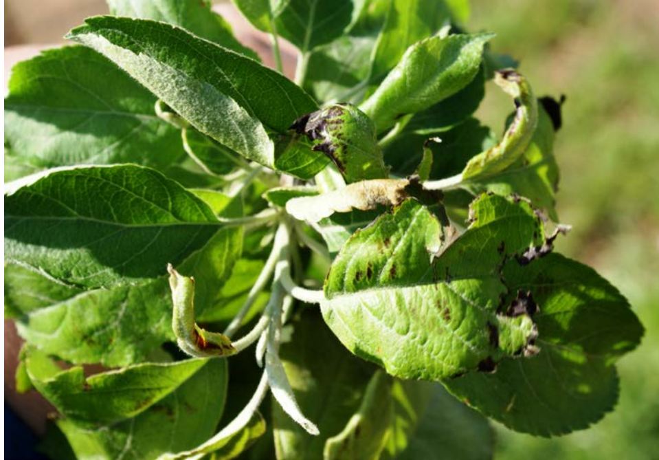
Fig 2. Granny Smith apple leaves with purplish-black discoloration caused by freezing temperatures. Tattering of leaves is due to mechanical (wind) injury.