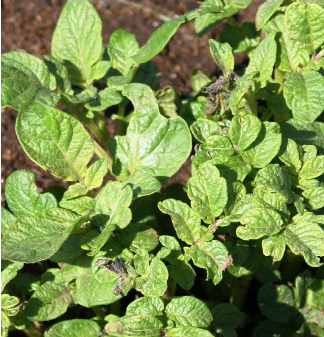
Fig 4. Potato leaves with minor dieback and discoloration following near freezing temperatures.