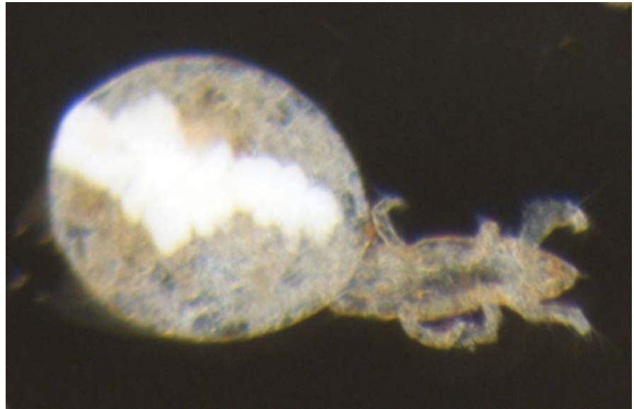
Gravid (pregnant) female straw itch mite.