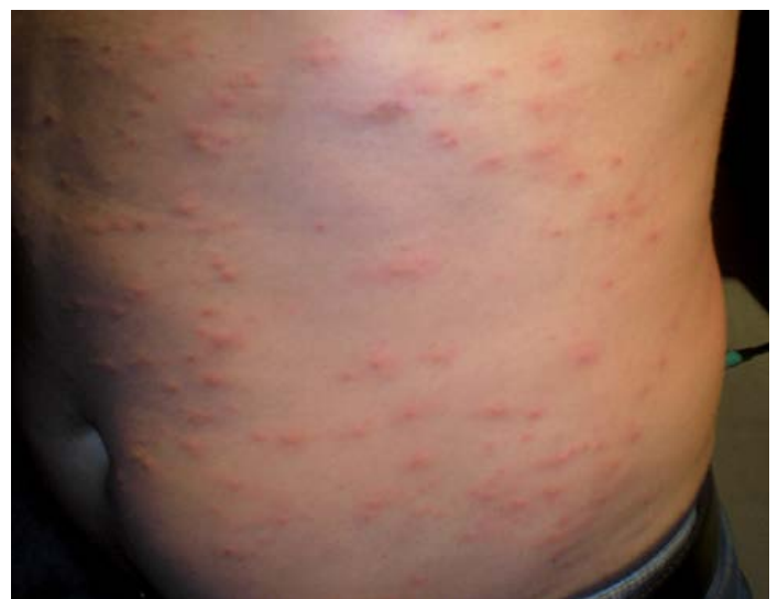
Rash caused by itch mites. Source: Corazza et al. 2014; Acta Derm Venereol 94: 248-249.

When individuals are working with hay that is infested with mites they can develop skin irritations from the abdomen to their shoulders. In severe outbreaks the mite bites can occur all over an individual's body. This mite is a non-burrowing mite and the bite mark is a result of a reaction to the mite's saliva. A characteristic of the bite are usually presented as a red welt with a central blister and is accompanied with a severe itching sensation. Rubbing or scratching the bite can result in secondary skin infections or dermatitis.