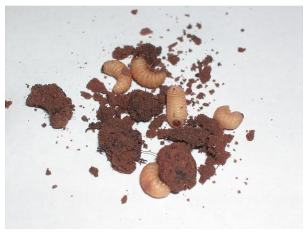
Figure 1: Pecan Weevil larvae