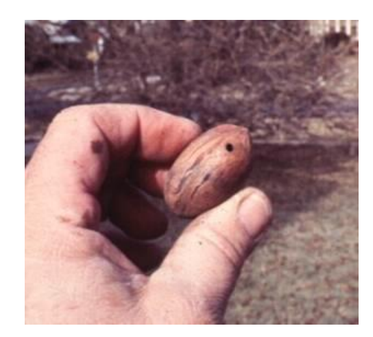
Figure 6: Pecan Weevil exit hole