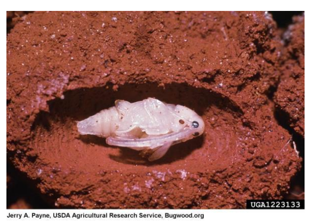
Figure 2: Pecan Weevil Pupa