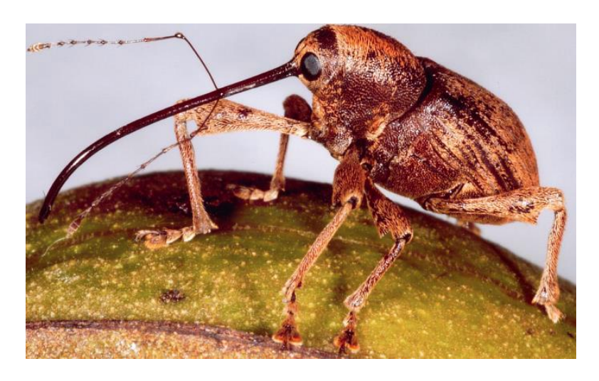
Figure 3: Pecan Weevil adult

Oviposition by female pecan weevils can occur as early as 2 days after emergence; however, the majority of egg production occurs 10-12 days after emergence. Regardless of how soon oviposition begins, it is initiated on early maturing varieties sooner than on trees that have late maturing nuts. Currently, the pecans at the OSU Cimmaron Valley Research Station are in the dough stage and have been treated twice for pecan weevil. Each female can average around 35-75 eggs deposited during her life. She will average about two-four eggs per nut. With a healthy weevil population, this can account for a great amount of damage.