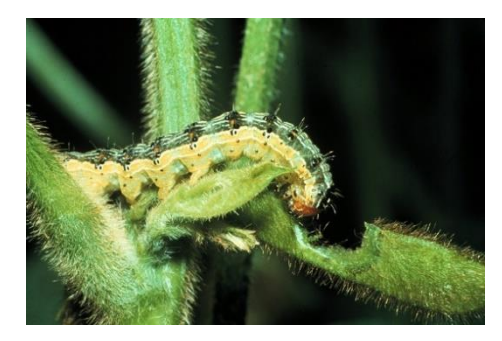
Clemson University-USDA Cooperative Extension Slide Series, Bugwood.org

Corn earworm (also known as the soybean podworm) is generally a pod feeder. <u>They have five pairs of prolegs, four pairs on the</u> <u>abdomen and one pair at the anal end (Figure 1 C)</u>. The body color varies with the host plant and ranges from shades of pink, yellow, green, brown, and black. Larvae usually have darker or lighter stripes running lengthwise on the body and can be positively identified by the presence of short, sharp microspines between the hairs on the body. Mature larvae reach 1.2 inches.