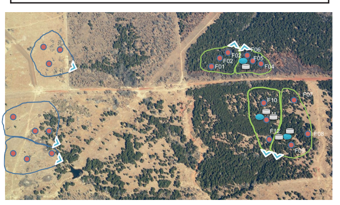
Figure 1. This aerial photo of OSU Cross Timbers Experimental Range shows the grassland watersheds (on the left) that have little redcedar encroachment. The redcedar woodland (on the right) has about 70 percent canopy cover of redcedar. The project is a multiple-year collaborative research effort between Oklahoma State University and the USGS Oklahoma Water Science Center with funding from the USGS-National Institutes of Water Research.

Additional publications are also available at: http://osufacts.okstate.edu