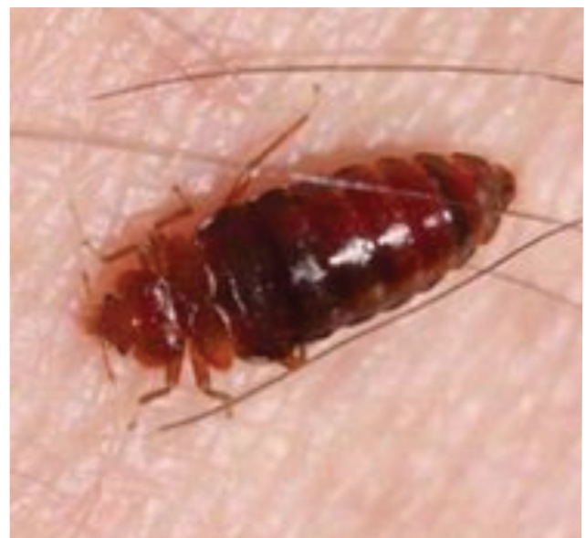
Figure 6. Before (top) and after (bottom) feeding.