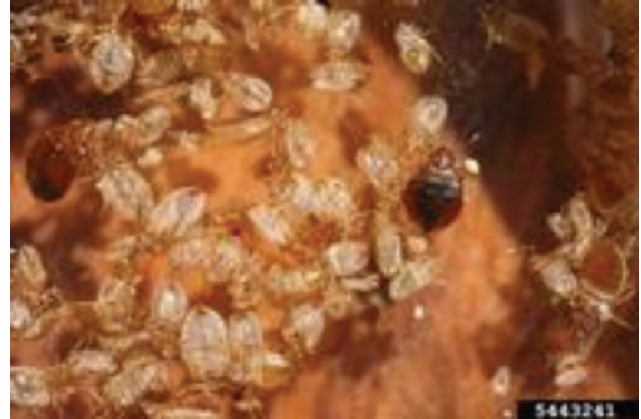
Figure 2. Young bed bugs.

Oklahoma Cooperative Extension Fact Sheets are also available on our website at: http://osufacts.okstate.edu