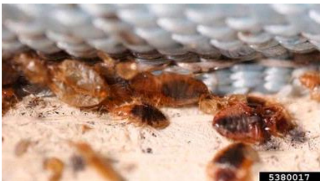
Figure 7. Bed bugs hiding under a mattress.