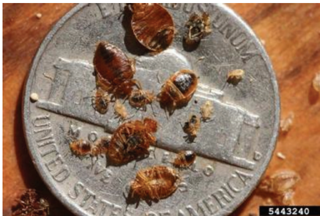
Figure 1. Bed bug life cycle.

Bed bugs are about the size and shape of an apple seed (Figure 1). Adult bed bugs are wingless, oval, flattened, red to dark brown and are about 1/5- to 3/8-inch long. Young bed bugs are smaller and are light tan or red (Figure 2). There are two other common species of blood feeding bugs, the bat bug and the swallow bug. They are closely related to bed bugs and look very much like them. The presence of bat bugs is an indicator that bats are living in the house. Swallow bugs establish in the nests of their bird host and will invade a house