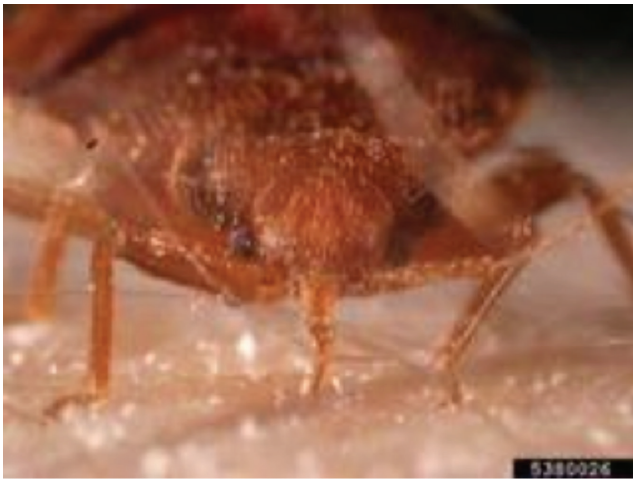
Figure 3. Bed bug feeding with needle-like beak.