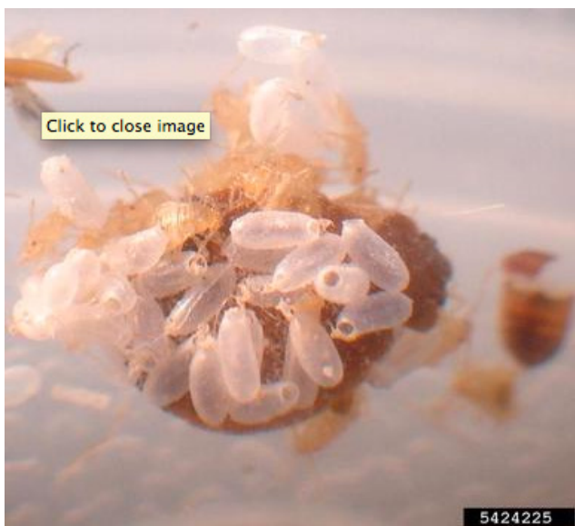
Figure 5. Bed bug eggs.