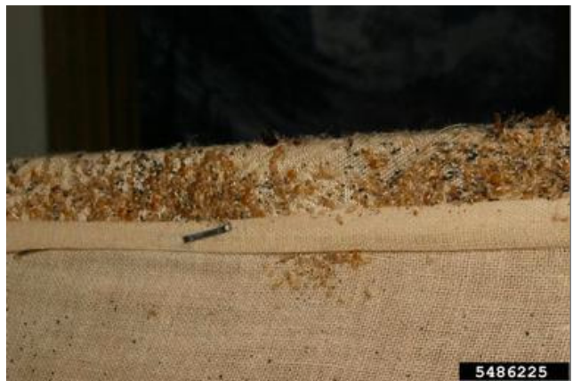
Figure 8. Bed bugs in used furniture.

Are your friends or family struggling with bed bugs? Refer them to the local county Cooperative Extension office.