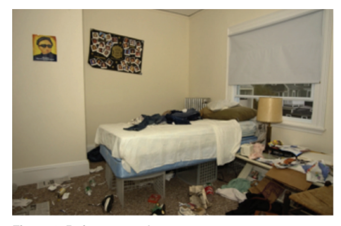
Figure 8. Before room clean up.

Over-the-counter pesticides are sometimes ineffective — we do not recommend that they be used for a do-it-yourself treatment. Bed bugs can be resistant to the ingredients in these products and may not be killed. Instead, a qualified