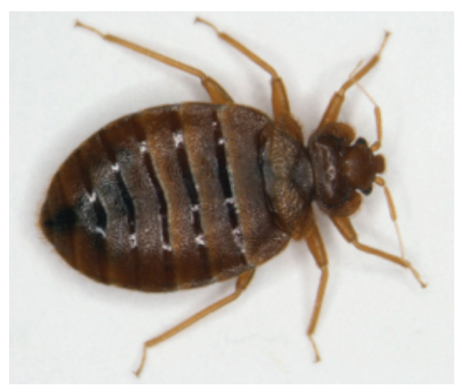
Figure 5. Adult bed bug.

most of them can be treated and saved. Throwing belongings out is unnecessarily expensive, will cause more stress and can actually spread bed bugs.