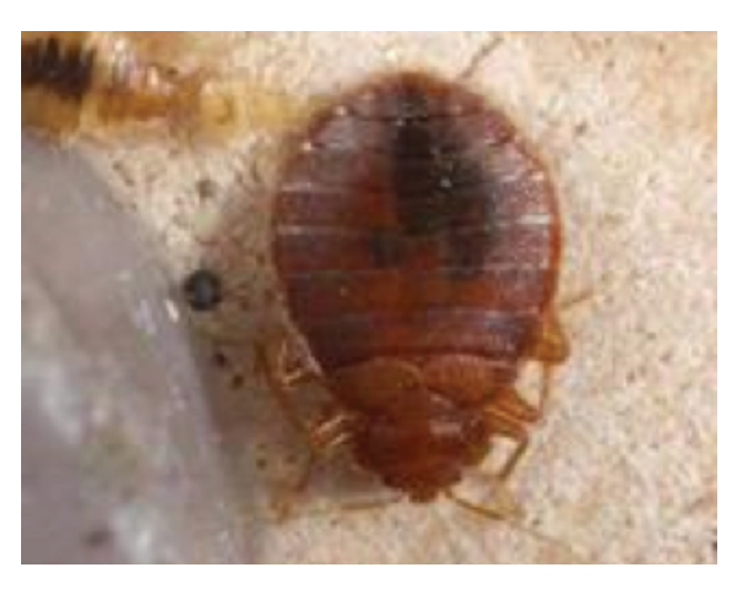
Figure 4: Bed bug.