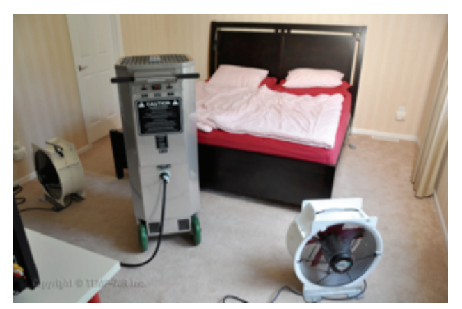
Figure 7. Heat treatment in bedroom.

Your pest management professional will likely come into your home and use heat to help kill the bugs. Many pest control companies use portable heaters to treat for bed bugs (Figure 7). They will heat the house or apartment up to around 130 degrees F and hold that temperature for four hours to six hours. Steam cleaners can also be used to heat treat bed bugs in furniture, bedding and other hiding spots.