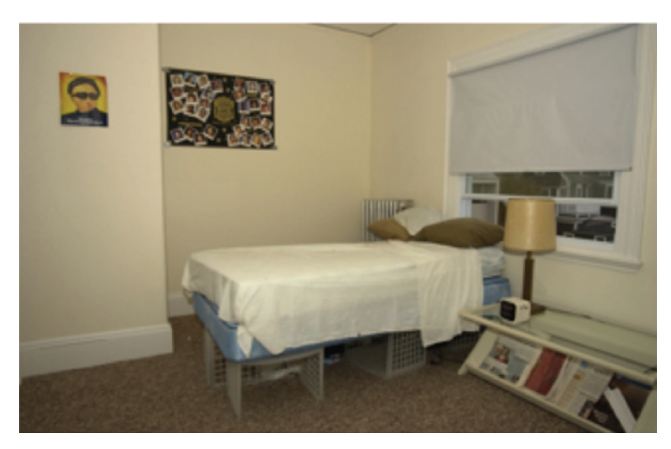
Figure 9. After room clean up.

pest management professional should be hired to tackle the problem. Pest management professionals will use sprays, dusts or aerosols known to eliminate bed bugs. Many products used by pest management professionals are formulated for specific types of applications, such as crack and crevice sprays, spot sprays, or wall void applications and require application by a licensed applicator. Pest management professionals are trained to use pesticides in the safest, most effective way possible.