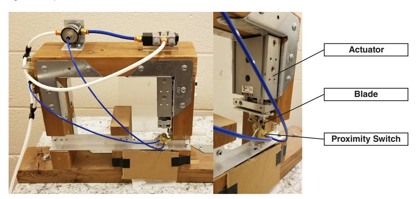
Figure 1. Prototype of a low-cost, automated, pneumatic cut-to-length device (cutter) installed in a temporary wooden framework. Left image shows side view. Right image shows the cutting blade, actuator and proximity switch (proximity switch is the brass component with compressed air supply and return). Note: guard removed for photo.

Figure 1 shows an example of an automated cutter installed in a temporary framework for testing and demonstration. Product is manually fed to the cutter through a short length of plastic tubing. The cutter uses a pneumatic proximity switch (model 1022, Clippard Instrument Lab Inc., Cincinnati, Ohio) to detect the presence of the product. When the product is detected, a cutting sequence is initiated. Because the proximity switch activates the cutter, the cut piece length is uniform, regardless of the feed rate (within system limitations). The system only requires compressed air to operate, is simple, fast and rugged.