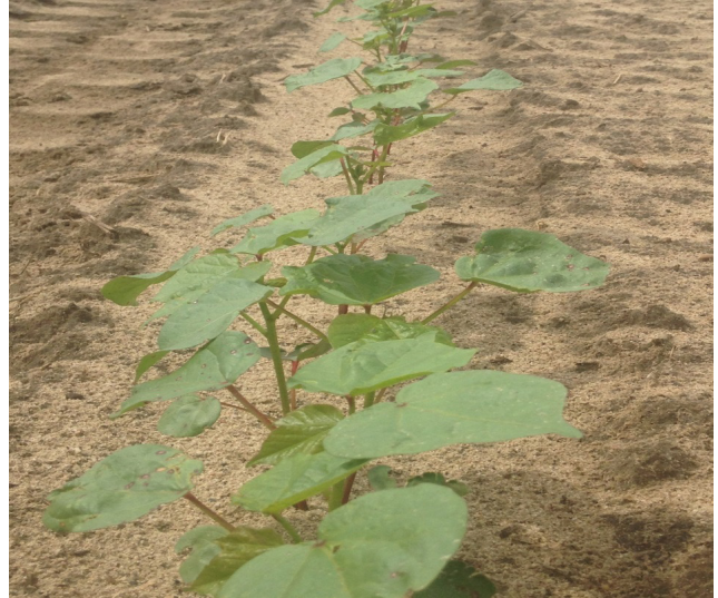
Figure 2. Cotton at the four- to five-leaf stage.

Oklahoma State University, as an equal opportunity employer, complies with all applicable federal and state laws regarding non-discrimination and affirmative action. Oklahoma State University is committed to a policy of equal opportunity for all individuals and does not discriminate based on race, religion, age, sex, color, national origin, marital status, sexual orientation, gender identity/ expression, disability, or veteran status with regard to employment, educational programs and activities, and/or admissions. For more information, visit https://eeo.okstate.edu .