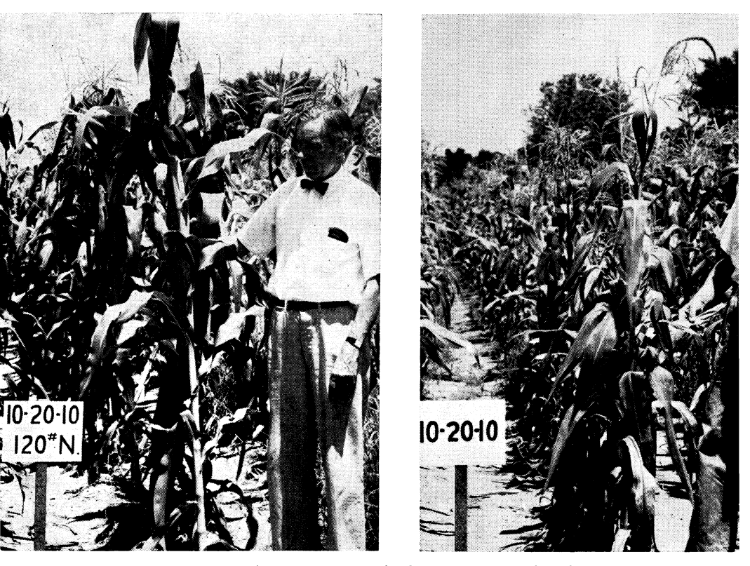
Fig. 2.—The relative effect of a starter fertilizer as compared with a nitrogen sidedressing is illustrated by this comparison on the Mont Davis farm. The 4-year average yield with only starter fertilization was 6.2 bushels per acre higher than with no fertilizer. Corn yields were increased about 20 bushels an acre when an adequate sidedressing of nitrogen was applied.

duced smaller ears and lower yields than similar stands with ample nitrogen.