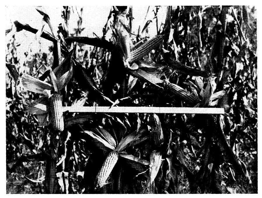
Fig. 3.—The ears of corn in this photograph are about the weight (one half pound) shown by Corn Belt studies as being the best average weight for maximum yield. The stalks are spaced 9 inches in the row.