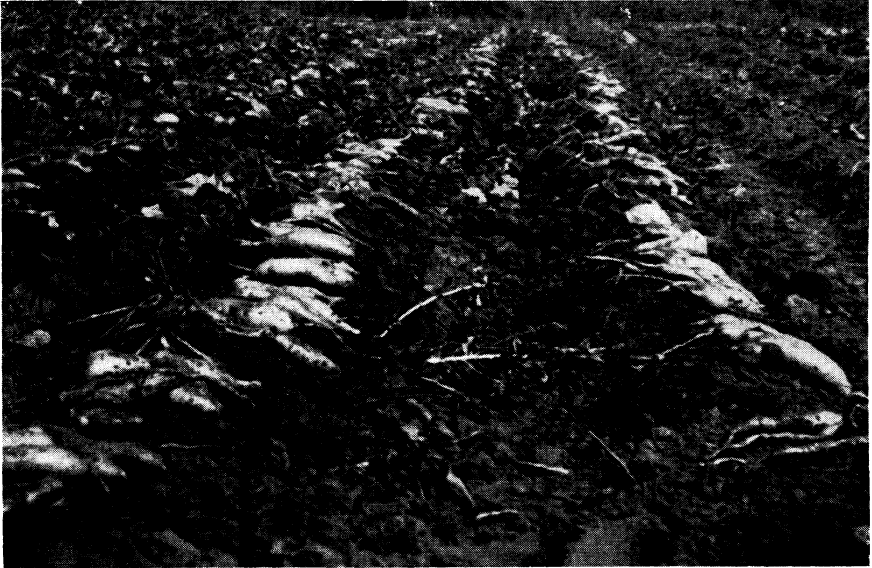
A good crop of Allgold sweet potatoes is shown in a field near Sapulpa. This crop was harvested at the conclusion of the dry 1952 season.

The trailing stem is purple, of moderate vigor and only of moderate length, with fairly short internodes. Some pubescence is present at terminals of vines. Foliage is moderately dense, leaf blades are entire and somewhat heart-shaped at the base. Petioles are erect, medium to short, green at the terminals and purple at the base of the vines.