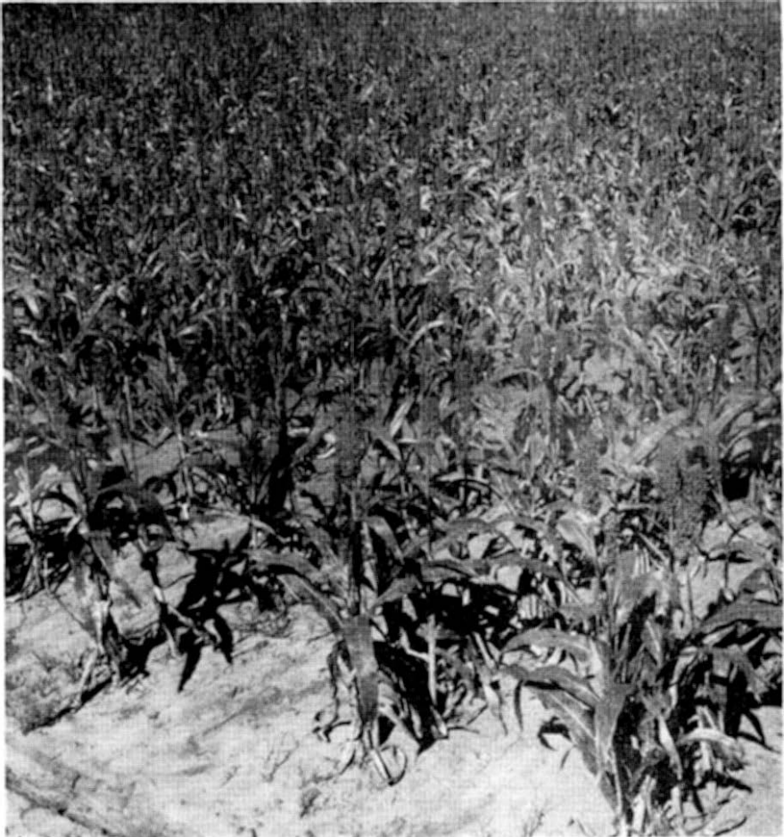
Field of REDLAN at Stillwater, Oklahoma.

Redlan is identical to Sharon kafir in maturity, and averages around 15 inches shorter than this non-combine height variety. In varietal experiments at Woodward and Perkins, Oklahoma, for seven