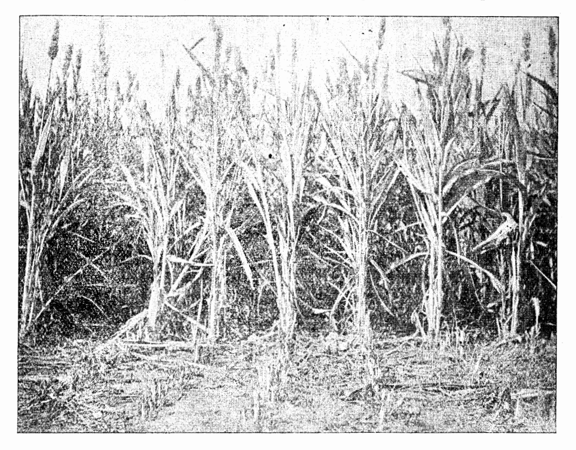
White Kafir Corn, Drills One Foot Apart.

Ten plats were seeded with sorghum and different varieties of Kafir, using a press drill. The sorghum was of an unnamed variety, the seed being obtained of a neighboring farmer who knew it only as sorghum or "cane." The drill rows were six inches apart and the drill set to sow approximately from onehalf to one bushel per acre for different plats. Three plats of