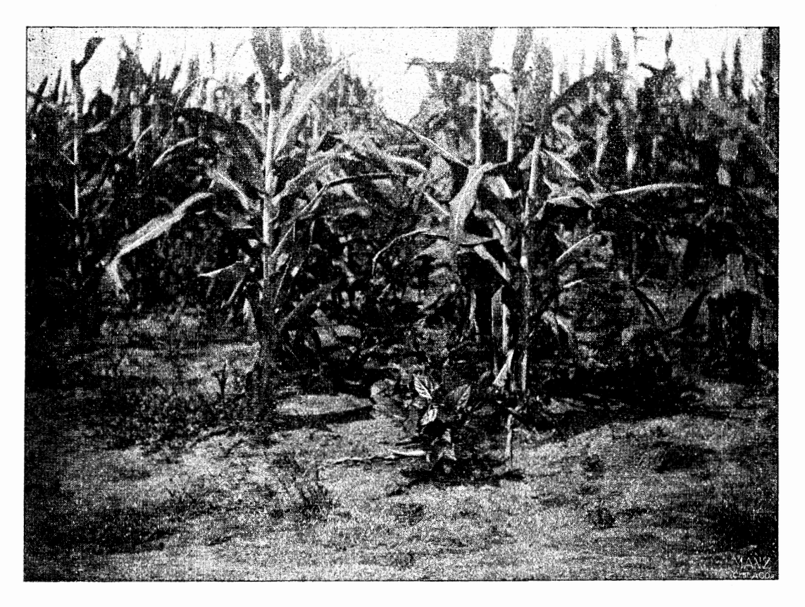
White Kafir, Rows Three Feet; Cow Peas Between.

An acre of alfalfa gave 6,055 lbs., or a trifle over three tons of well dried hay at three cuttings. the first cutting, May 19, giving one and one-half tons; the second, June 23, within a few pounds of 2,600 lbs. Alfalfa sown in early part of August, with