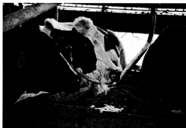
Heat stress is a seasonal factor that decreases dry matter intake and can affect milk production and composition.

Age (Parity): While milk fat content remains relatively constant, milk protein content gradually decreases with ad-