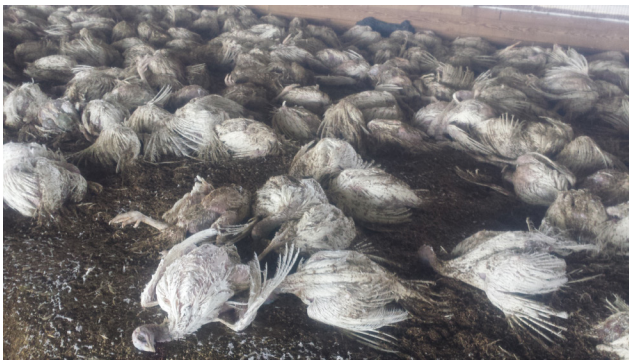
Figure 1. Turkey mortality resulting from highly pathogenic avian influenza.

Infected birds have either died from the disease or been euthanized to control disease spread. Proper carcass management is vital for both controlling disease and managing nutrients. Improper disposal may cause odor nuisance and spread disease, and the resulting leachate (carcass fluids) could negatively impact water sources. The avian influenza virus may still be present within the carcass, litter, feed or eggs and could be spread by insects, rodents, predators and subsurface or aboveground water movement, as well as through direct contact with other birds, leading to increased disease transmission risks. For these reasons, proper mortality management practices must be implemented immediately following a disease outbreak. Strict biosecurity measures must be followed to prevent disease transmission from human activity.