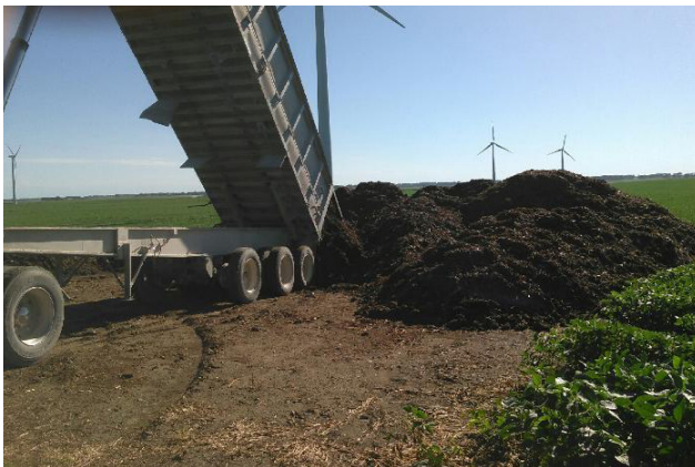
Figure 9. Final turkey mortality compost after 28 days with an average received analysis of 60-46-36 (N-P-K; pounds per ton) at 28 percent moisture content.