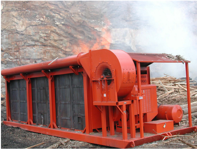
Figure 3. Incineration of poultry carcasses.

Proper incineration requires a closed air unit, can be conducted on-site and is a pathogen inactivation procedure. An air quality permit may be required. Check with state officials. Several incinerators are required during a large animal disease outbreak. Fuel costs and carcass throughput are important factors to consider, especially when managing large amounts of carcass material. For large poultry operations, incineration may be adopted in combination with other mass mortality management practices.