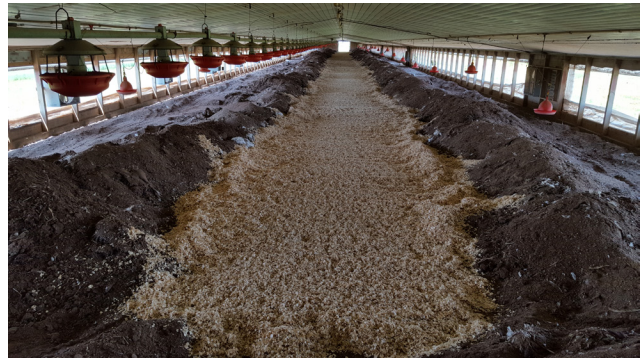
Figure 5. Mortality compost windrow carbon base.