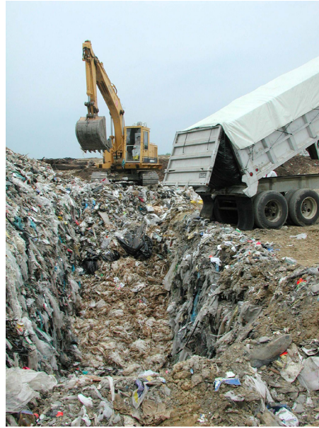
Figure 4. Landfill disposal of poultry.

By definition, composting is a controlled biological decomposition process that converts organic matter into a