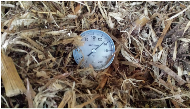
Figure 7. Turkey mortality compost temperatures above 131 F.