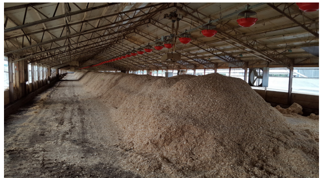
Figure 6. Indoor turkey mortality compost windrow.