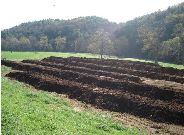
Figure 8. Outdoor mortality compost windrows.