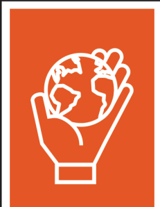
Global & Cultural Competencies