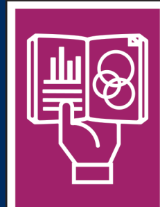
Research, Creative & Scholarly Activities