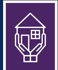
Service Learning & Civic Engagement