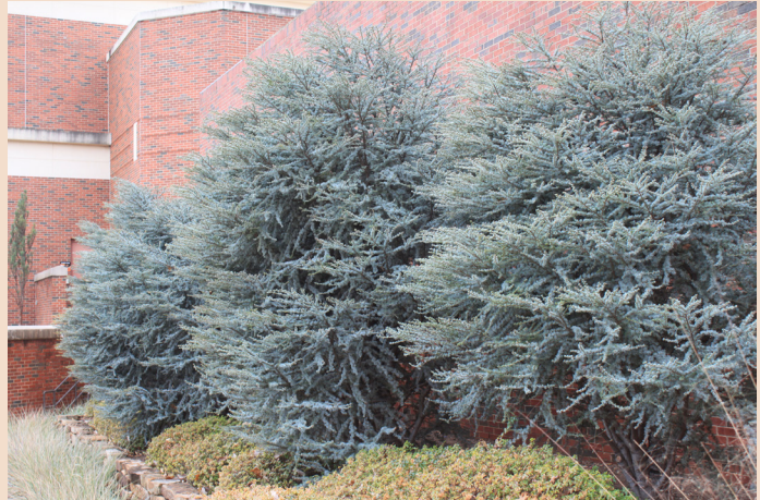
Horstmann blue atlas cedar ( Cedrus atlantica 'Horstmann')