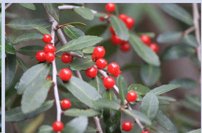
Fruit of yaupon holly.