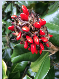
Southern magnolia seed pods

Cherrylaurel, Carolina ( Prunus caroliniana ) Cypress, Arizona ( Cupressus arizonica ) Holly, ( Ilex spp.) Juniper ( Juniperus spp.) Magnolia, Southern ( Magnolia grandiflora ) Pines ( Pinus spp.) Waxmyrtle, Southern ( Morella cerifera )