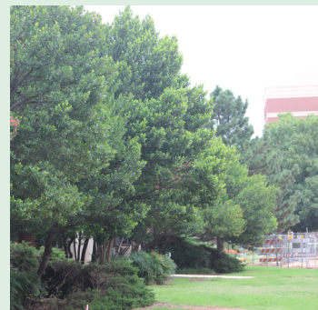
Cherrylaurel ( Prunus laurocerasus )