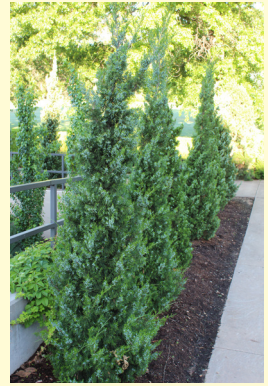
Eastern redcedar cultivar ( Juniperus virginiana )

Arborvitae ( Thuja spp.) Cherrylaurel, Carolina ( Prunus caroliniana ) Holly, Yaupon ( Ilex vomitoria ) Juniper ( Juniperus spp.) Pine, mugo, ( Pinus mugo ) Pine, Pinyon ( Pinus edulis ) Pine, ponderosa ( Pinus ponderosa ) Waxmyrtle, Southern ( Morella cerifera )