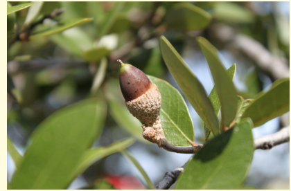
Escarpment Live Oak acorn