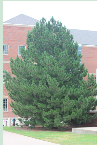
Austrian pine ( Pinus nigra )

Cherrylaurel, Carolina ( Prunus caroliniana ) Cypress, Leyland ( X Cupressocyparis leylandii ) Falsecypress, Hinoki ( Chamaecyparis obtusa )* Falsecypress, Whitecedar or Altantic ( Chamaecyparis thyoides )* Holly, Yaupon ( Ilex vomitoria ) Juniper, Chinese ( Juniperus chinensis ) Magnolia, Southern ( Magnolia grandiflora ) Pine, Austrian ( Pinus nigra ) Pine, Bosnian ( Pinus heldreichii ) Pine, Japanese Black ( Pinus thunbergii ) Pine, Loblolly ( Pinus taeda ) Pine, Mugo ( Pinus mugo ) Pine, Scots or Scotch ( Pinus sylvestris ) Pine, Short Leaf ( Pinus echinata )* Pine, Slash ( Pinus elliotii )* Oak, Live ( Quercus virginiana ) Redcedar, Eastern ( Juniperus virginiana ) Spruce, Dwarf Alberta ( Picea glauca 'Conica') Spruce, Colorado ( Picea pungens ) Waxmyrtle, Southern ( Morella cerifera )