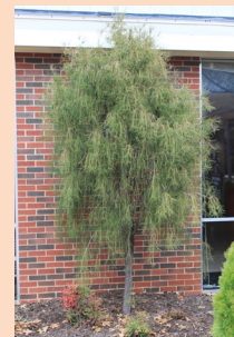
Threadleaf American arborvitae ( Thuja occidentalis 'Filiformis')

Arborvitae ( Thuja and Platycladus spp.) golden and blue foliage forms, columnar and threadleaf forms Cedar, Atlas ( Cedrus atlantica ) Golden, blue and weeping forms Chinafir ( Cunninghamia lanceolata )* interesting foliage and bark on mature plants Cypress, Arizona ( Cupressus arizonica ) blue, gold and weeping forms Cypress, Italian ( Cupressus sempervirens )* fastigiata, golden forms Holly ( Ilex spp.) variegated and weeping forms Incensecedar, California ( Calocedrus decurrens )* interesting bark Oak, Escarpment Live ( Quercus fusiformis ) picturesque branching structure Pine ( Pinus spp.) blue, gold, weeping and columnar forms