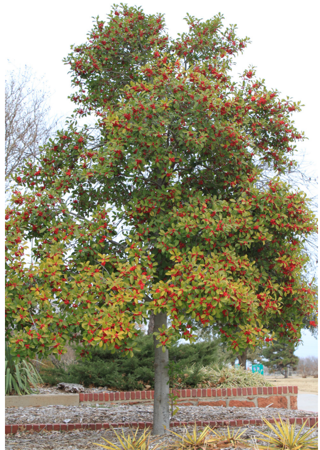
Foster Holly ( Ilex x attenuata 'Fosteri') in winter.

Finally, consider how much maintenance the plant will require and any possible disadvantages including susceptibility to attack by disease and insect pests, soft or brittle wood that