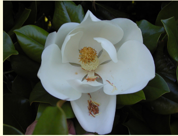
Southern Magnolia flower

Cherrylaurel, Carolina ( Prunus caroliniana ) Holly ( Ilex spp.) Juniper ( Juniperus spp.) Magnolia, Southern ( Magnolia grandiflora ) Magnolia, Sweetbay ( Magnolia virginiana )* Oak ( Quercus virginiana and Q. fusiformis ) Pine ( Pinus spp.) Redcedar, Eastern ( Juniperus virginiana ) Waxmyrtle, Southern ( Morella cerifera )