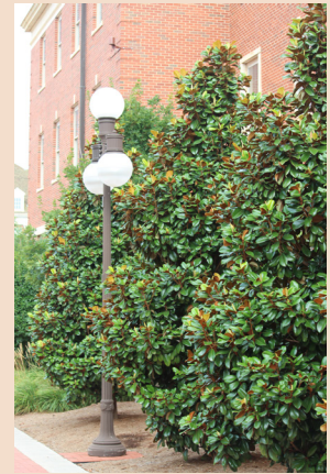
Teddy Bear® Southern Magnolia ( Magnolia grandiflora 'Southern Charm')

Arborvitae ( Thuja and Platycladus spp.) Cherrylaurel ( Prunus laurocerasus ) Cherrylaurel, Carolina ( Prunus caroliniana ) Chinafir ( Cunninghamia lanceolata )* Cypress ( Cedrus spp.), (x Cupressocyparis spp.)* and ( Cupressus spp.)* Falsecypress ( Chamaecyparis spp.)* Holly ( Ilex spp.) Incensecedar, California ( Calocedrus decurrens )* Juniper ( Juniperus spp.) Magnolia, Southern ( Magnolia grandiflora ) Pines ( Pinus spp.) Waxmyrtle, Southern ( Morella cerifera )