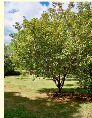
Carolina Cherrylaurel ( Prunus caroliniana )

Cherrylaurel, Carolina ( Prunus caroliniana ) Falsecypress ( Chamaecyparis spp.)* Holly ( Ilex spp.) Juniper ( Juniperus spp.) Magnolia Southern (dwarf selections) ( Magnolia grandiflora ) Pine, Mugo (dwarf forms) ( Pinus mugo )