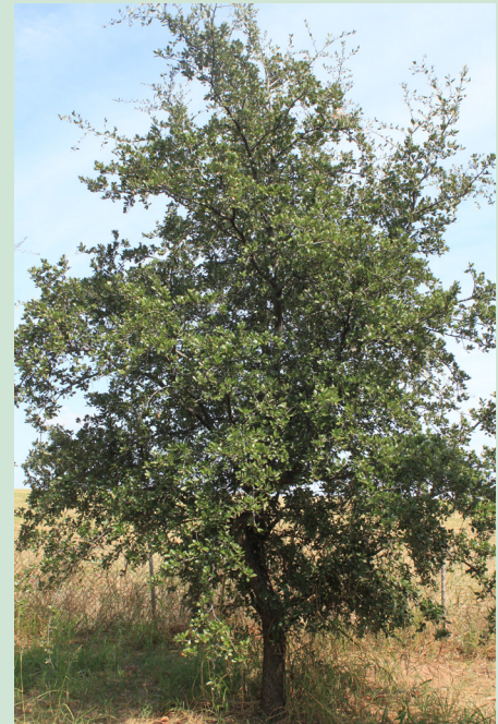
Escarpment Live Oak ( Qercus fusiformis )

Arborvitae, American or Eastern ( Thuja occidentalis ) Arborvitae, Giant Western Redcedar ( Thuja plicata ) Cherrylaurel, Carolina ( Prunus caroliniana ) California Incensecedar ( Calocedrus decurrens )* Cypress, Arizona ( Cupressus arizonica ) Holly, American ( Ilex opaca ) Holly, Yaupon ( Ilex vomitoria ) Juniper, Eastern Redcedar ( Juniperus virginiana ) Juniper, Rocky Mountain ( Juniperus scopulorum ) Magnolia, Southern ( Magnolia grandiflora ) Magnolia, Sweetbay ( Magnolia virginiana )* Pine, Eastern White ( Pinus strobus )* Pine, Limber ( Pinus flexilis )* Pine, Loblolly ( Pinus taeda ) Pine, Pinyon ( Pinus edulis )* Pine, Short Leaf ( Pinus echinata )* Pine, Slash ( Pinus elliotii )* Pine, Southwestern White ( Pinus strobiformis )* Pine, Virginia ( Pinus virginiana )* Oak, Live ( Quercus virginiana )* Oak, Escarpment Live ( Qercus fusiformis )* Waxmyrtle, Southern ( Morella cerifera )