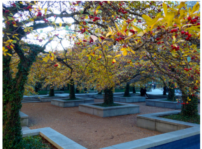
Figure 6. Art Institute of Chicago, South Garden designed by Dan Kiley.