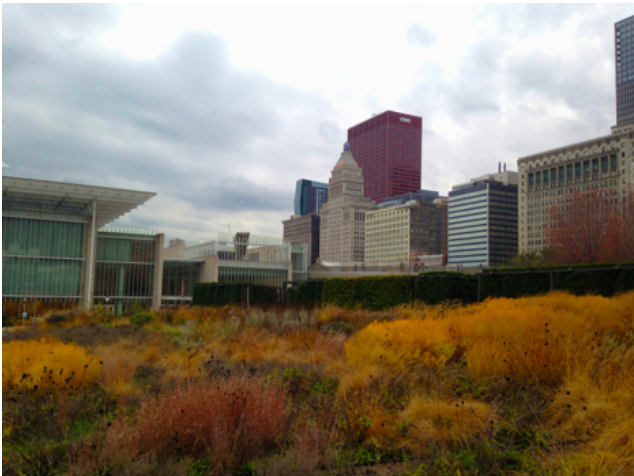
Figure 5. Lurie Garden in Millennium Park at fall, Chicago designed by Gustafson Guthrie Nichol Ltd & Terry Guen Design Associates, Inc.