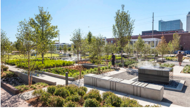
Figure 1. Guthrie Green, Tulsa, OK designed by SWA