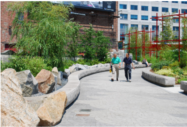
Figure 3. Chinatown Park, Boston, MA designed by Carol R. Johnson Associates (CRJA-IBI)