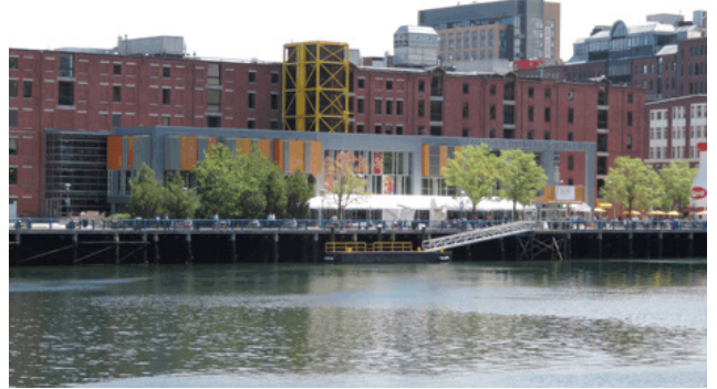
Figure 4. Urban plaza at Boston Children's Museum designed by Michael Van Valkenburgh Associates