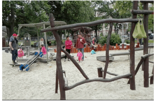
Figure 8. Alexander W. Kemp Playground at Cambridge Common, Harvard Square, Massachusetts