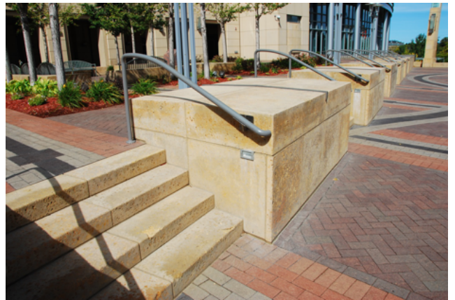
Figure 10. Reinforced retaining wall as part of the security design at the front of Federal Reserve Bank of Minneapolis.