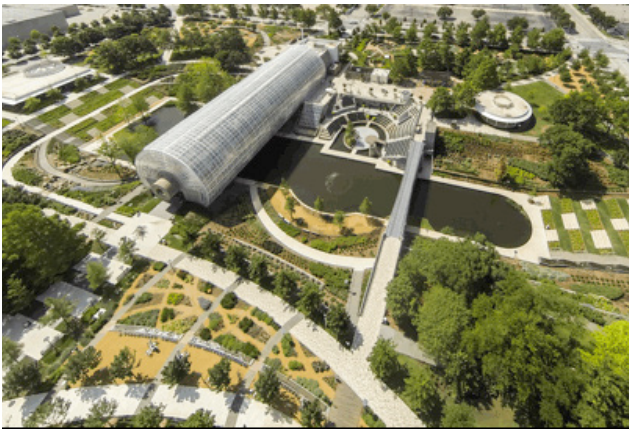
Figure 9. Myriad Botanical Gardens, Oklahoma City, OK designed by OJB.