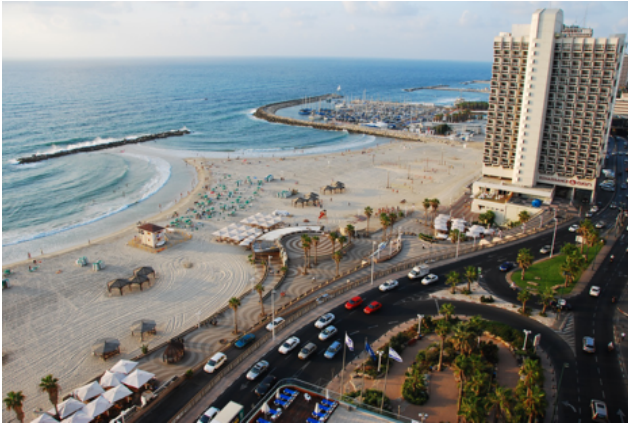
Figure 7. Mediterranean Sea ocean front in Tel Aviv, Israel.