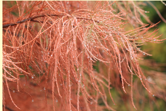
Baldcypress fall color

Redbud ( Cercis spp.) Silverbell, Carolina ( Halesia tetraptera )* Soapberry, Western ( Sapindus saponaria var. drummondii )* Sour Gum or Tupelo ( Nyssa sylvatica ) Sourwood ( Oxydendrum arboreum )* Sweetgum ( Liquidambar styraciflua ) Tuliptree or Tulip Poplar ( Liriodendron tulipifera ) Walnut, Black ( Juglans nigra ) Yellowwood, American ( Cladrastis kentukea ) Zelkova, Japanese ( Zelkova serrata )