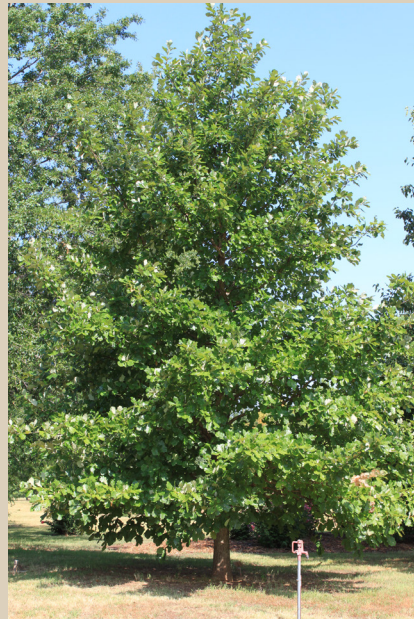
Swamp white oak