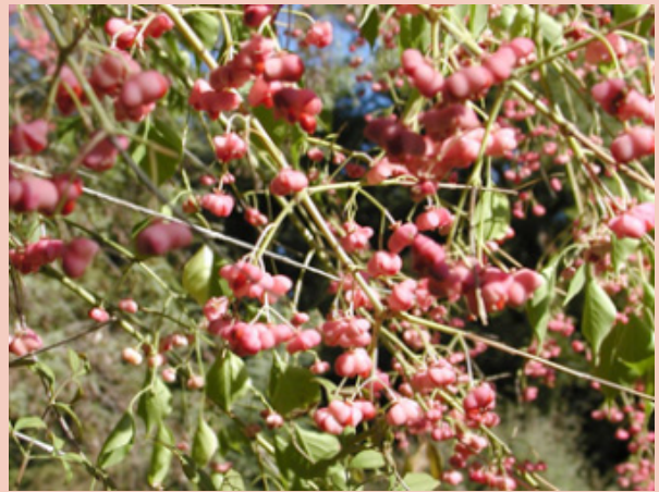
Fruits of winterberry euonymus