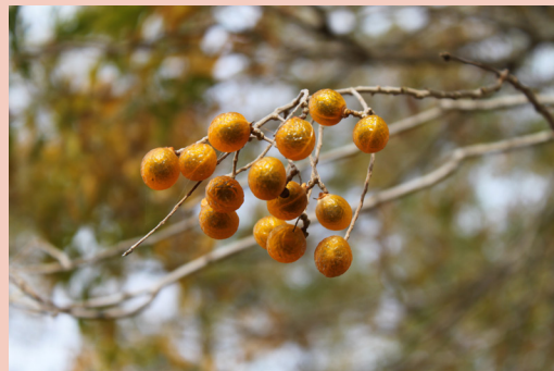
Fruits of Western soapberry