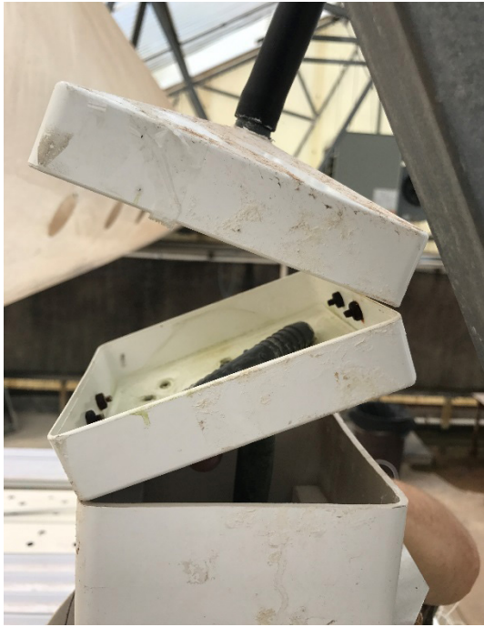
Figure 4. Both white vinyl pyramid post tops attached to tower.

clear silicone for aquariums to avoid corrosion (Figure 4).