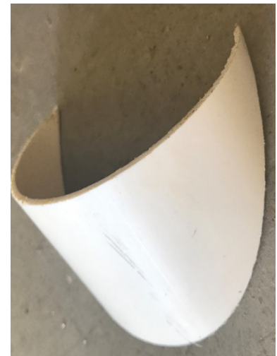
Figure 2. Net pot support.