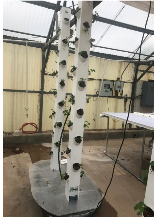
Figure 1. Vertical towers holding 56 plants.

A tower garden, also called a window farm is a system of vertical hydroponics, which includes an A-Frame hydroponic system, hydroponic wall and cascades of bottles. It can be used for growing various crops like strawberry, lettuce, Swiss chard, herbs, spinach, kale, broccoli and flowering petunia. There are various online sources to get these systems, which can cost around $500 or more, but you can build your own tower garden for much less. It can also be used for growing plants indoors if lights are provided above the tower, which is popular in urban areas with only a small space for gardening. The tower garden design described here can hold 28 plants per tower and two towers can be placed in a 5-foot x 5-foot space, producing 56 plants at one time (Figure 1). The design can be modified according to preference. For example, towers can be hung from the top and can drain to a single tank to collect the nutrient solution. Materials listed below can be found at a hardware store, except the net pots which can be purchased from hydroponic dealers or online. If tower material is modified, make sure to use food grade material. To view safety sheet on Vinyl fence post see: http://www.culpeperwood.com/images/uploads/Barrette_MSDS_PVC_Products_1.pdf .