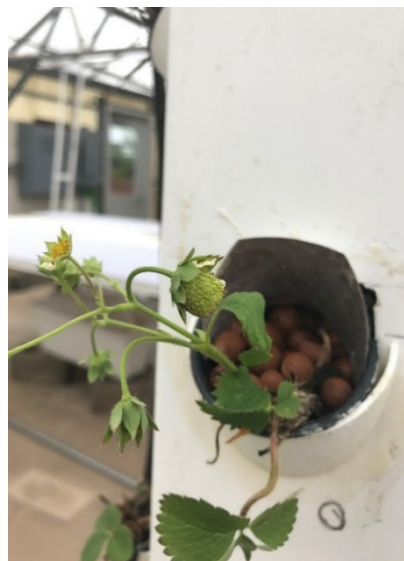
Figure 6. Strawberry plant with water splash shield on it.