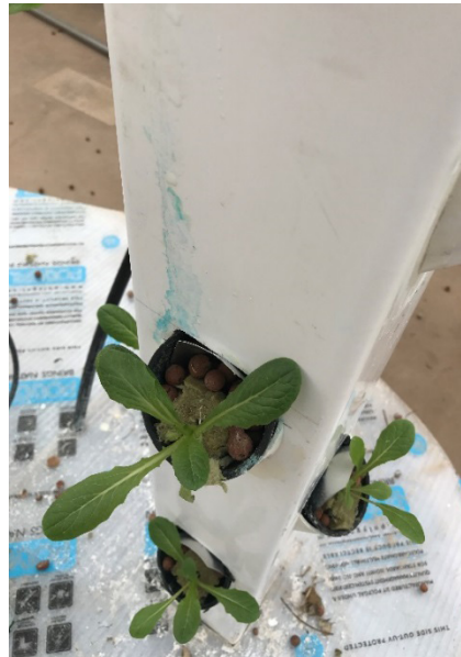
Figure 5. Lettuce plants placed in vertical tower.