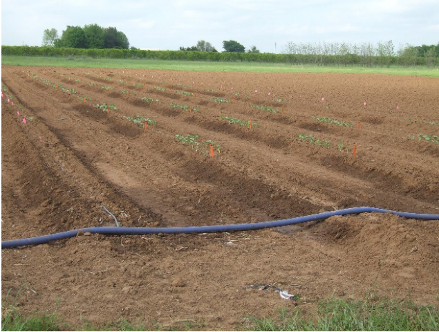
Drip irrigation system with header line.

tems. Drip irrigation is often used in situations where there is not adequate water volume or pressure to meet the higher use requirements for overhead systems. Drip systems are a very efficient means of distributing irrigation water since water is either applied to the surface of the soil or subsurface with buried drip-tape. Drip irrigation is the best option if the crop is grown on mulched beds. Other benefits to drip irrigation include being able to carry on other field operations during irrigation, not wetting the crop foliage, thereby reducing crop disease pressure and being able to fertilize through the drip system.