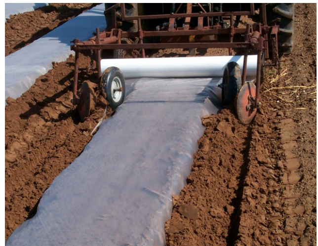
Free-standing raised bed.

Okra is generally grown in locations where the crop will receive full sunlight throughout the day. Soil types for okra production can vary, with loams and sandy loams preferred, but even heavier soils can produce well if the soil drains well enough to prevent water-logging. If soil drainage is less than optimal, then okra will benefit from the use of free-standing raised soil beds. These beds can be formed by the use of implements such as a disk harrow adjusted to pull soil to the center or, if available, a commercial bed-shaper. The latter is the best option if drip irrigation and plastic mulch are to be utilized. Combination bed-shapers and mulch layers are used to form a bed and install drip tube and mulch in a single operation. If the producer does not want the expense of plastic mulch, then the bedder-shaper can be used without installing mulch. As with most vegetable crops, okra will produce higher yields if supplemental irrigation is available during drought conditions. Root knot nematodes can be a problem and producers should rotate okra fields to non-host crop species, such as annual grasses or cereal grains, to reduce the chances of nematode populations increasing.