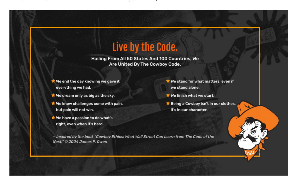
Figure 3 The Cowboy Code (Oklahoma State University, 2021b)