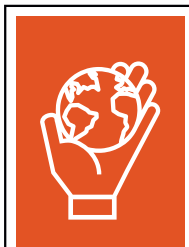
Global & Cultural Competencies