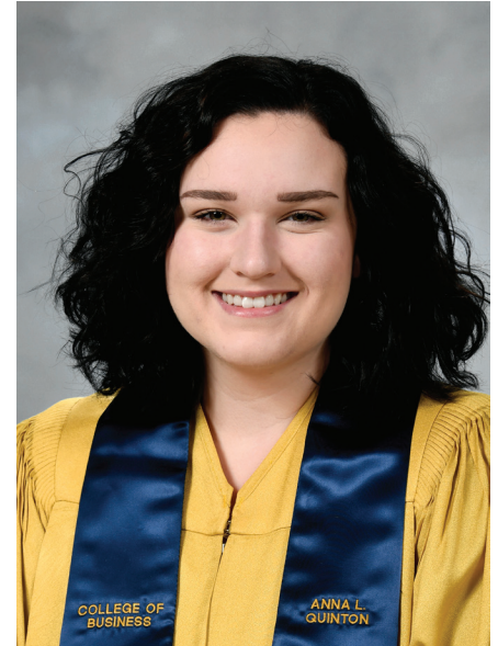
ANNA LEIGH QUINTON COLLEGE OF BUSINESS