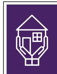
Service Learning & Civic Engagement