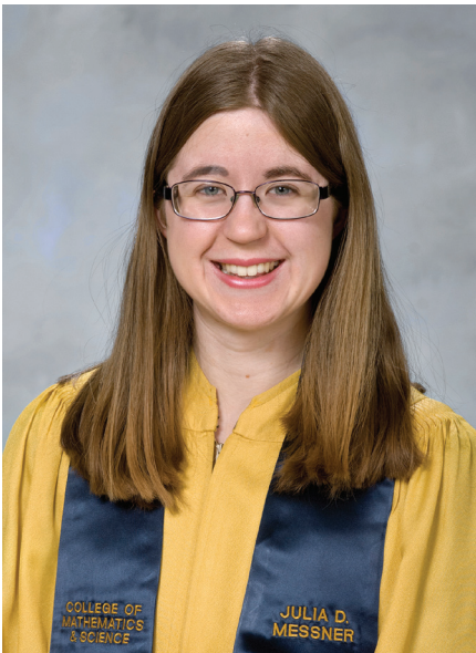
JULIA D. MESSNER COLLEGE OF MATHEMATICS & SCIENCE