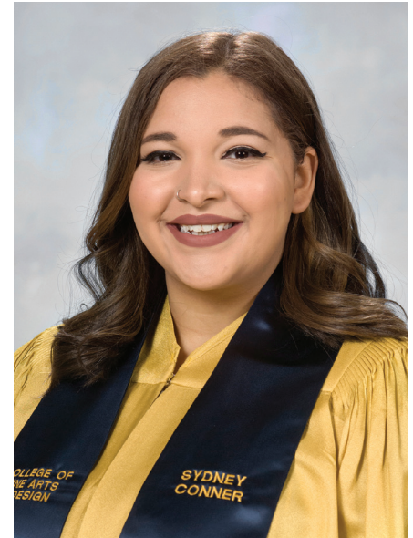
SYDNEY CONNER COLLEGE OF FINE ARTS & DESIGN