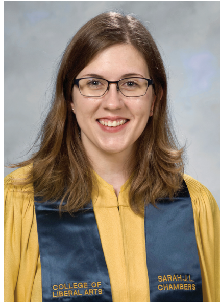
SARAH J.L. CHAMBERS COLLEGE OF LIBERAL ARTS