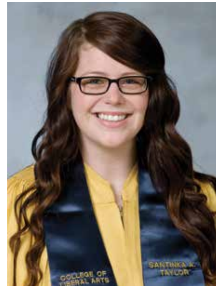
SANTINKA A. TAYLOR COLLEGE OF LIBERAL ARTS