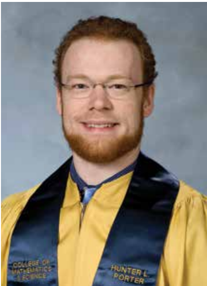
HUNTER L. PORTER COLLEGE OF MATHEMATICS & SCIENCE