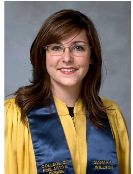
SARAH LOUISE WILLSON COLLEGE OF FINE ARTS & DESIGN