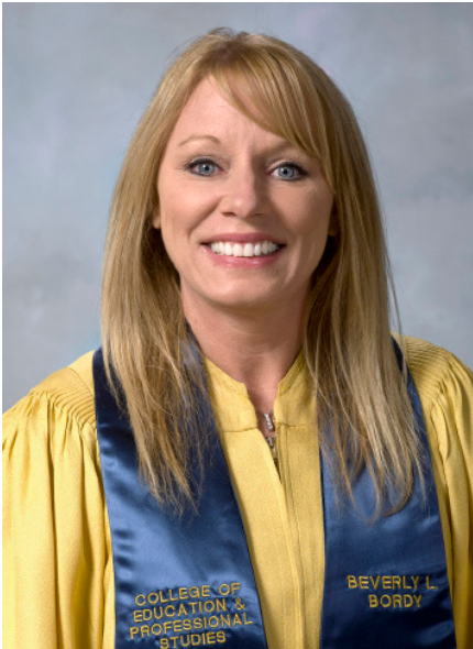
BEVERLY LYNN BORDY COLLEGE OF EDUCATION & PROFESSIONAL STUDIES