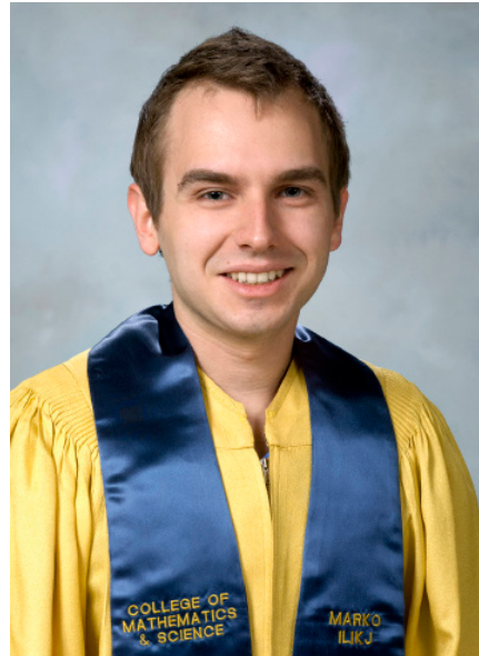
MARKO ILKIJ COLLEGE OF MATHEMATICS & SCIENCE