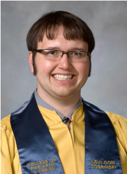
LEVI DOBRINSKI COLLEGE OF FINE ARTS & DESIGN