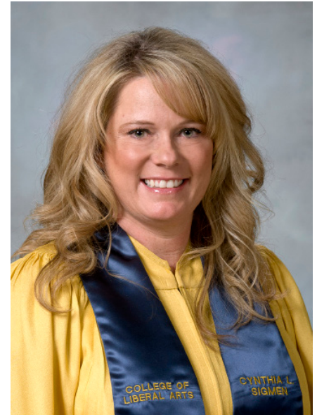
CYNTHIA SIGMEN COLLEGE OF LIBERAL ARTS