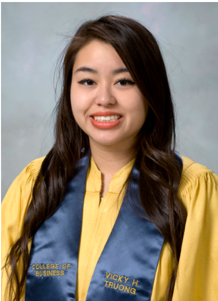
VICKY TRUONG COLLEGE OF BUSINESS