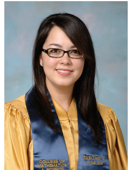
TABITHA C. WILKINS COLLEGE OF MATHEMATICS & SCIENCE