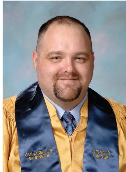
DEVIN B. ELDER COLLEGE OF BUSINESS