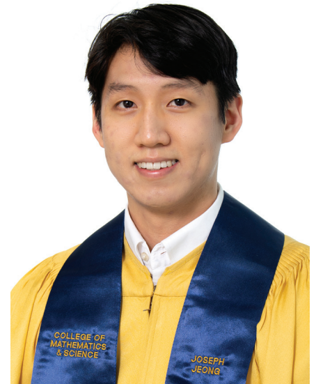
JOSEPH JEONG COLLEGE OF MATHEMATICS & SCIENCE