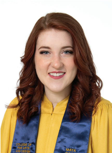
MAYA COOK COLLEGE OF FINE ARTS & DESIGN