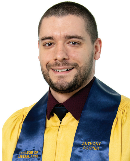
ANTHONY COOPER COLLEGE OF LIBERAL ARTS