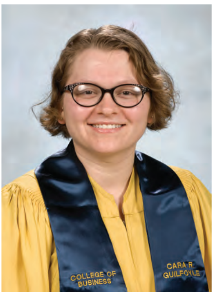
CARA GUILFOYLE COLLEGE OF BUSINESS