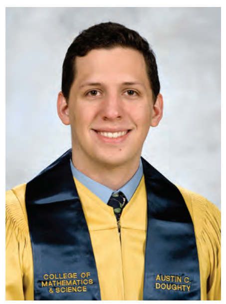
AUSTIN DOUGHTY COLLEGE OF MATHEMATICS & SCIENCE