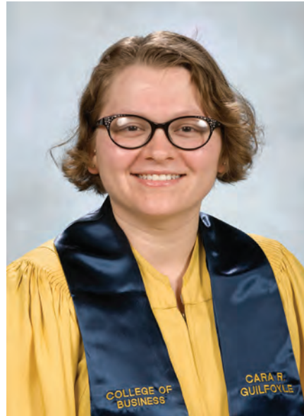
CARA GUILFOYLE COLLEGE OF BUSINESS