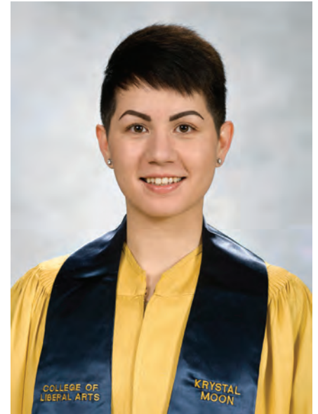
KRYSTAL MOON COLLEGE OF LIBERAL ARTS