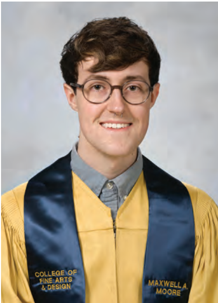
MAXWELL MOORE COLLEGE OF FINE ARTS & DESIGN