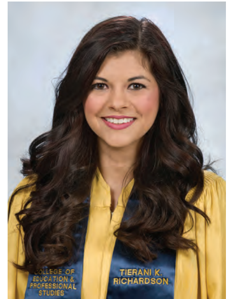
TIERANI RICHARDSON COLLEGE OF EDUCATION & PROFESSIONAL STUDIES