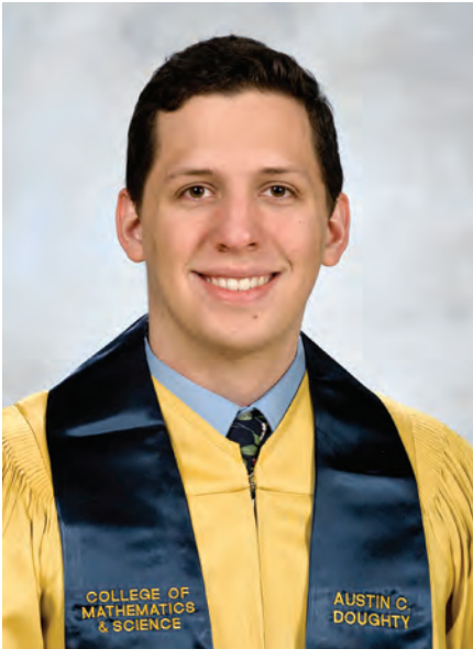
AUSTIN DOUGHTY COLLEGE OF MATHEMATICS & SCIENCE