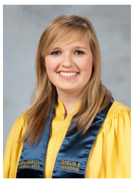
JOYCLIN E. JAKSONS COLLEGE OF LIBERAL ARTS