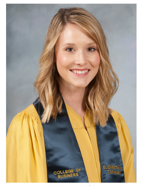
ELIZABETH M. TOWNLEY COLLEGE OF BUSINESS