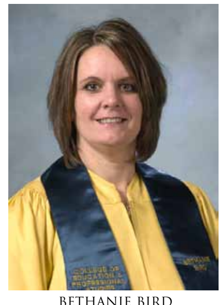
BETHANIE BIRD COLLEGE OF EDUCATION & PROFESSIONAL STUDIES