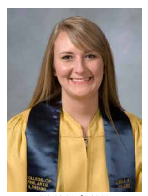
LENA K. CLARK COLLEGE OF FINE ARTS & DESIGN