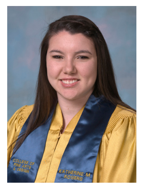
KATHERINE M. ROGERS COLLEGE OF FINE ARTS & DESIGN