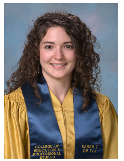
SARAH TEHGA DE TOY COLLEGE OF EDUCATION & PROFESSIONAL STUDIES