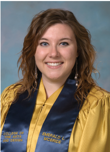
EMERALD LESSLEY MCBRIDE COLLEGE OF FINE ARTS & DESIGN