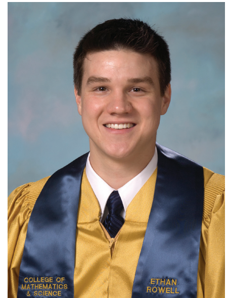
ETHAN B. ROWELL COLLEGE OF MATHEMATICS & SCIENCE