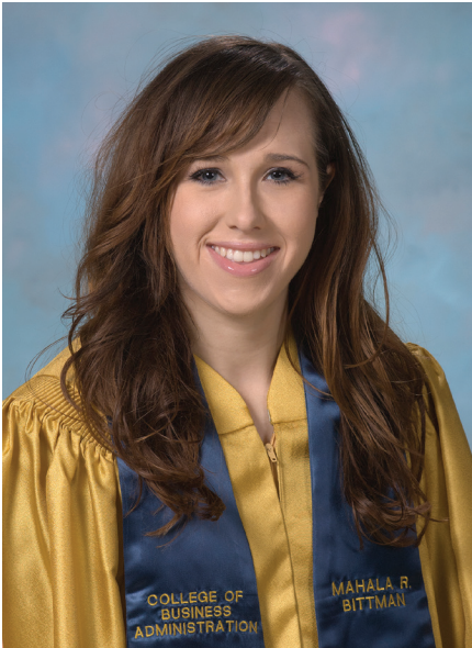
MAHALA RENEE BITTMAN COLLEGE OF BUSINESS ADMINISTRATION