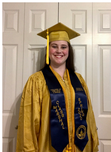
KATAYLA MONGOLD COLLEGE OF FINE ARTS & DESIGN