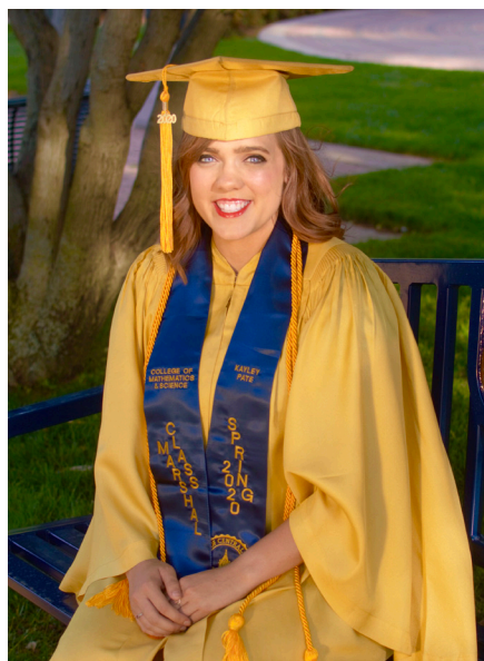
KAYLEY PATE COLLEGE OF MATHEMATICS & SCIENCE