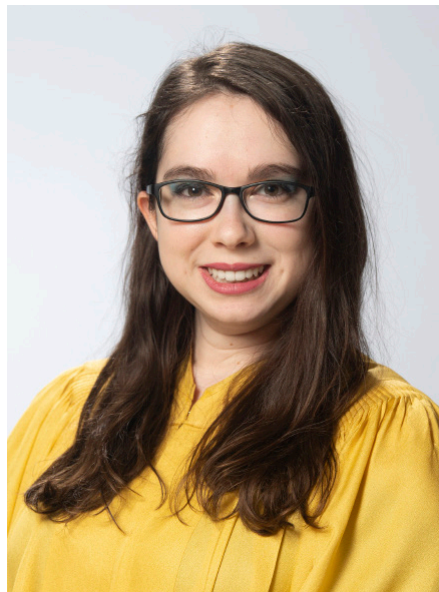
DELANEY SPITZ COLLEGE OF BUSINESS