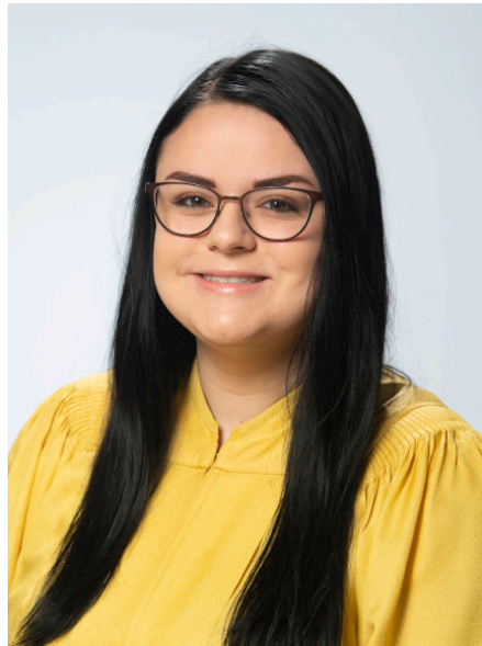
CARLEY DANCER COLLEGE OF LIBERAL ARTS