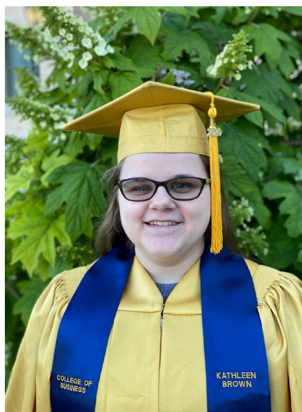
KATHLEEN BROWN COLLEGE OF BUSINESS