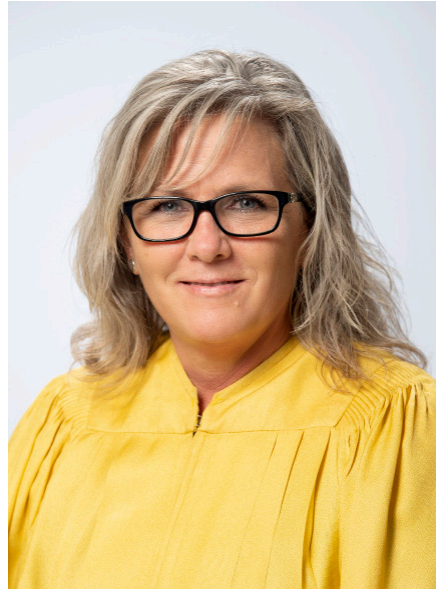
JULIE MORROW COLLEGE OF EDUCATION & PROFESSIONAL STUDIES