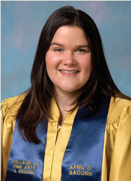
APRIL D. BACORN COLLEGE OF FINE ARTS & DESIGN