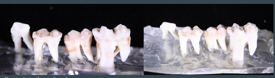
Crest cavity toothpaste, lingual