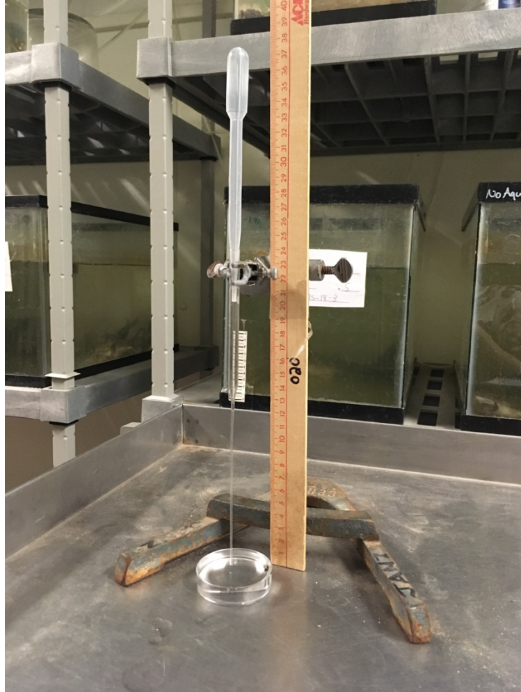
Figure 1. Test apparatus used to produce an air puff stimulus to Xenopus laevis tadpoles to test predator avoidance behavioral thresholds.