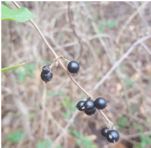
Figure 2: Photograph of the black berries of L. japonica at Lake Sanborn in Stillwater, OK.