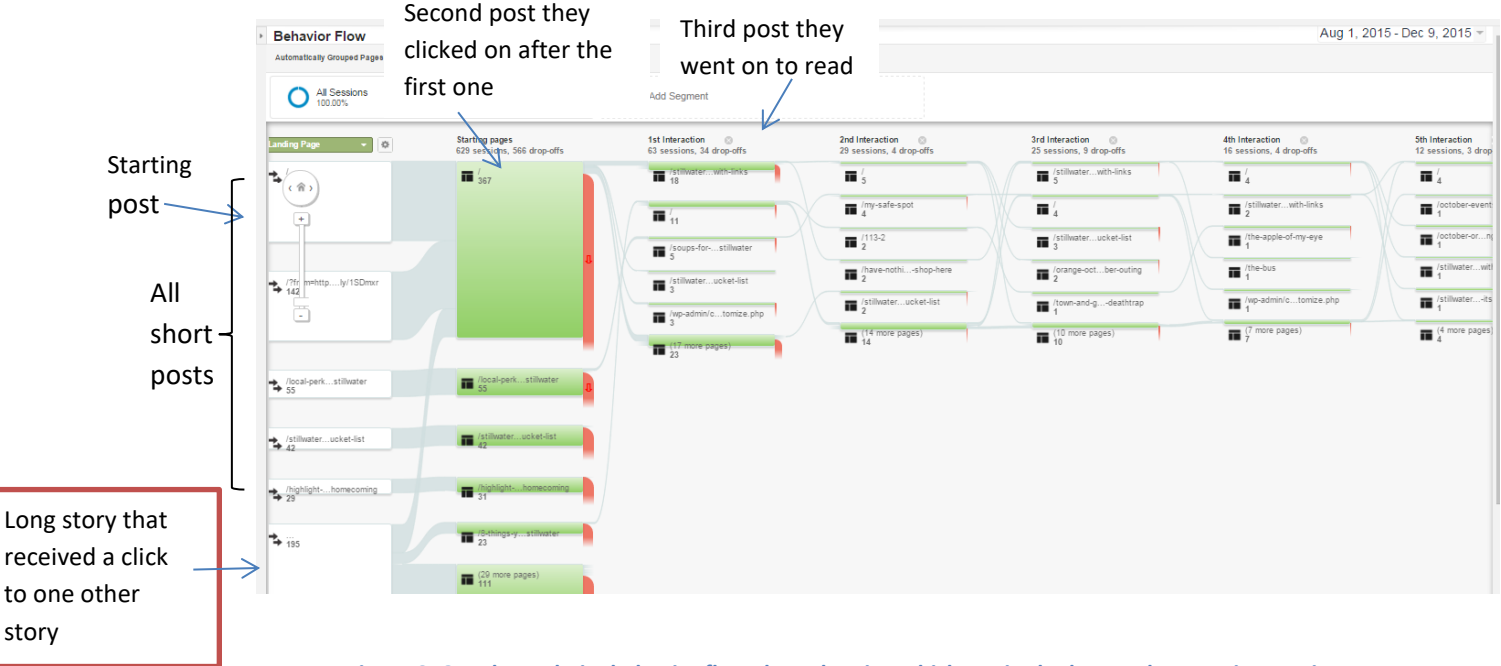
Figure 6: Google Analytics behavior flow chart showing which stories had more than one interaction

200 words. Only one of my long stories, "My Safe Spot", received a click to another story. My shorter stories on the other hand received more than three clicks to other stories. Below is a picture of my Google Analytics Behavior Flow, it shows the starting page and then which articles people continued on to read.