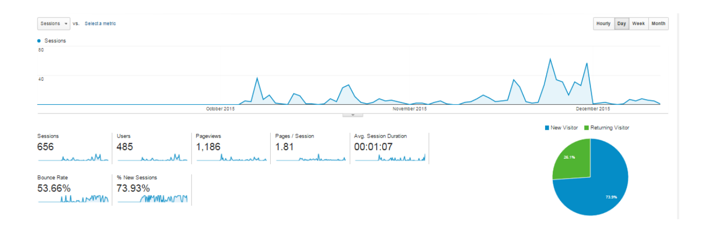
Figure 1: Google Analytics chart with my websites data.

According to Google Analytics, the main demographic for my site is people from Stillwater followed by people from Dallas. Also, my audience is mainly women. The number of women,104, nearly doubles the amount of men, 51. Most people, 52 percent of my audience, accessed my content by a mobile device. 45 percent of the sessions were accessed on an iPhone and 6 percent was accessed on a Samsung device. These were mainly new users, 143 of the 256 new users recorded. 38 percent used their desktop with the main browser being Safari. And 10 percent accessed the content using a tablet. People accessing the content on a desktop usually stayed on the page for, on average, a minute longer than other devices. They also had a lower bounce rate and viewed twice as many pages as the mobile devices. The average time on a page is two minutes and my most popular post has been Stillwater Date Ideas From A to Z with 142 views.