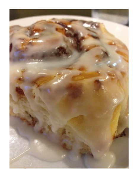
Figure 9: Cinnamon roll from Granny's Kitchen

about. It often does a better job of creating credibility for what the story is trying to sell to the reader. You can say going to Granny's Kitchen to try a warm gooey cinnamon roll topped with homemade icing is a must try but if the reader sees a photo, like the one in Figure 9, he or she are often more likely to be drawn to actually visit the establishment mentioned in the article.