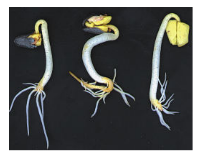
Cotton seedlings exhibiting chilling injury

The two seedlings below show normal root development. When the two groups are compared it may be noted that seedlings injured by chilling are often short with thickened hypocotyls and radicles, dead root tips, and show some signs of lateral root growth.