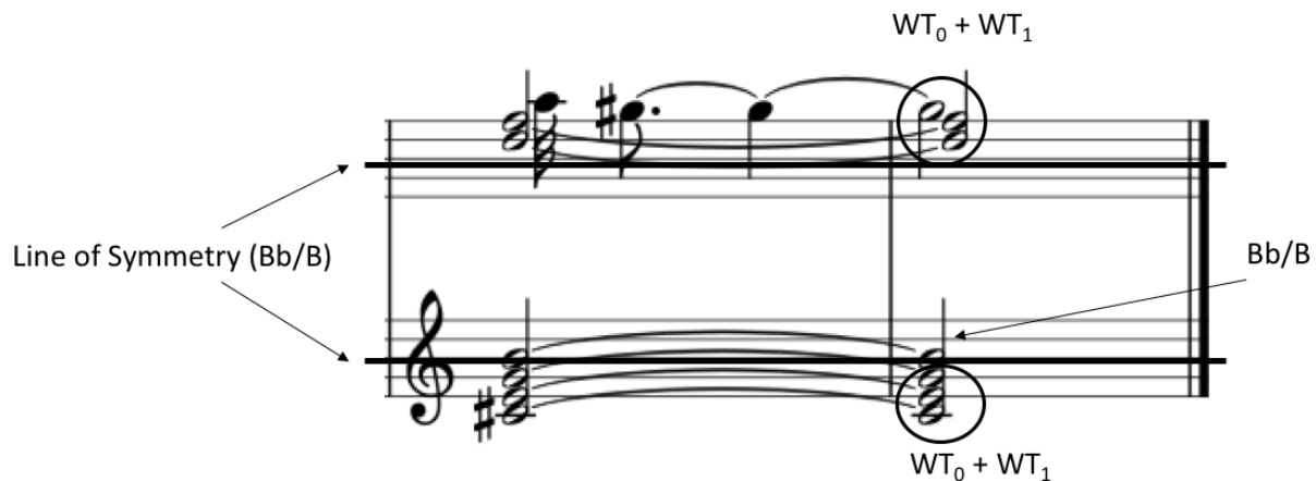
Figure 6.6: "Butterfly Singed its Wings," from Capriolen , Op. 32, last two measures

scales. 210 They are precisely symmetrical around the cluster Bb/B (which contains one note from both WT 0 and WT 1 ). This property is certainly not accidental and could be viewed as a “reconciliation” of the conflict between the two whole tone scales (WT 0 and WT 1 ) which was set up early in the work.