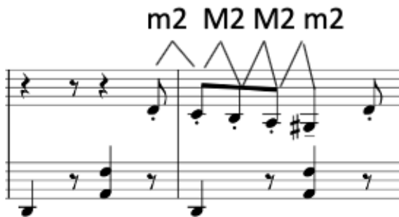
Figure 6.14 "The Circus is Coming!" from Capriolen , Op. 32, mm. 4–5

As mentioned previously, d'Albert reharmonizes the opening melodic material from A on each return with progressively more chromaticism and less harmonic stability. A' contains significant reharmonization and increased use of chromaticism (Figure 6.15). Beginning in measure 21, d'Albert reharmonizes the melodic material to function in F-sharp minor. Measures 25–26 function temporarily in D, alternating between the dominant harmony and a German augmented sixth chord. This harmonic alternation could theoretically function in the minor or major mode, adding to the sense of ambiguity. Chromatic harmonic planing is also used to harmonize the main melodic material. D'Albert uses melodic fragmentation to build intensity in this section which culminates in the climax of the piece in measure 34 (Figure 6.15).